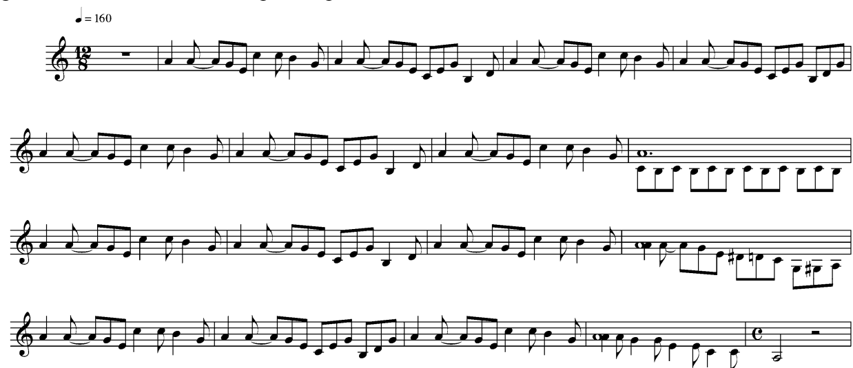
Fig. 5.10. Transcription of instrumental break added to “Meanings” in the show “A World within a World,” allowing for more dancing

incorporate more dancing into the show (fig. 5.10). The choreographed moves she danced with Muller included her African dance steps. The music for the break was also a combination of African and non-African elements. The meter shifts from the 4/4 of the original song into a complex meter and fast tempo common in West African music, while the melody suggests an Irish jig. The riff on a blues scale, together with the instrumentation of saxophone and electric guitar, further render the component parts unidentifiable.