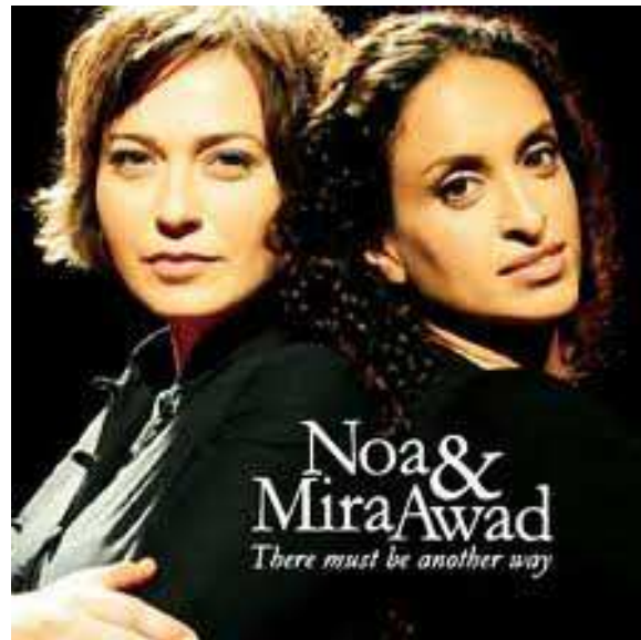
Fig. 2.10. The album Awad produced with Achinoam Nini, There Must Be Another Way , portrays her as Israeli Arab representative and symbol of coexistence.

There are a number of factors that have supported the success of this collaboration. The two artists are well matched in their music, vocal timbre, and polished performance style. In addition, the multiple ethnic and religious dichotomies at play in their pairing, with its conflicting power relationships in their dominant and subordinate roles, work to problematize racial stereotypes. Noa's Yemenite heritage makes her look more stereotypically Middle Eastern, while Awad's Bulgarian features highlight her Europeaness. As Noa said, "Some people will see an Arab girl who looks Jewish and a Jewish girl who looks Arab, which is what we are. Maybe it will open some people's minds" (Associated Press 2009). In this context the way Awad's European features expose Arabness as culturally constructed rather than written on the body undermines racist discourses. The two artists also perform this problematization sonically. In general, Noa sings in Hebrew and Awad in Arabic, but sometimes on the song "Will You Dance with Me" Awad sings a line in Hebrew and Noa a line in Arabic. The switch is brief but powerful in foregrounding the performative aspect of the labels. Their performance thus reveals "multiracialization as a specific set of practices, technologies and power relations that is both socially produced and open to change and contestation" (Haritaworn 2012:28).