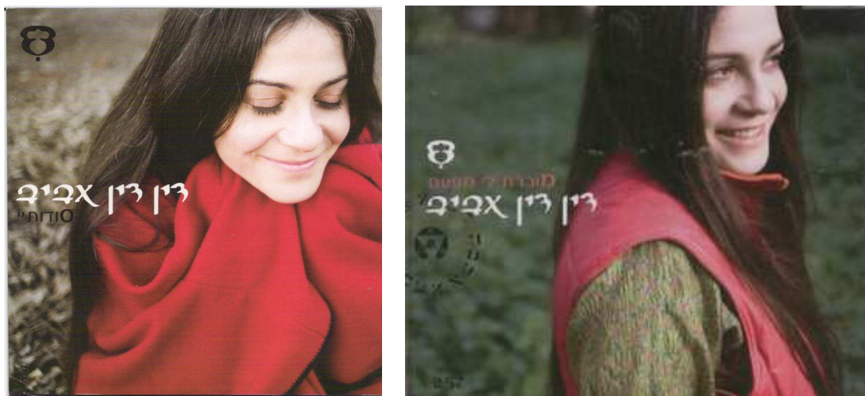
Fig. 5.6. The artwork on My Secrets employs the nature imagery of New Age discourse.