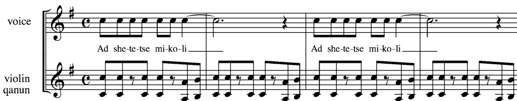
Fig. 3.8. Transcription of climactic moment in “Obsession” building intensity through repetition.

Another way Dikla’s music diverges from classical Egyptian music is in the way she recreates the dramatic excitement that characterizes that repertoire. Whereas singers of Arab music create tension through repetition that often involves improvisatory change of minor details and sometimes modulation, Dikla does it through repetition but does not vary her vocal line. The climax of “Obsession” comes with the second line of the text, which is in Hebrew: “The sky is blue / until you come out of my voice.” This second part of this line is repeated seven times, with an addition of an echo after the fifth iteration (fig. 3.8). Dikla’s music is thus accessible to audiences that do not have the knowledge of maqam modulation that audiences of Arab music have. Instead, her use of repetition here indexes one of the most intense moments in Jewish liturgy, the closing service for the Day of Atonement, a day of fasting and prayer. The congregation chants “Adonai is God” seven times, a final plea for divine forgiveness as the gates of heaven close. I interpret this reference as reflecting Dikla’s background in an observant Jewish home, which I will discuss in relation to another song.