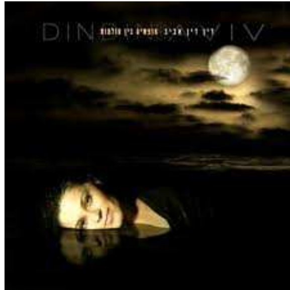
Fig. 5.7. The album artwork for Free Between Worlds combines New Age nature imagery and symbols of Jewish spirituality.

liminality. The full moon is another such symbol. It is prominent in the photographs, and the CD itself is printed with a photograph to look like a full moon. Moons and orbs are common in New Age imagery. It also signifies the lunar calendar on which Judaism is based. In Judaism the moon is significant for women, who are forbidden to work on the new moon of each month, or Rosh Chodesh (Kosofsky 2004). The night setting is also linked to the Orthodox Jewish custom that women immerse in the mikveh only after nightfall.