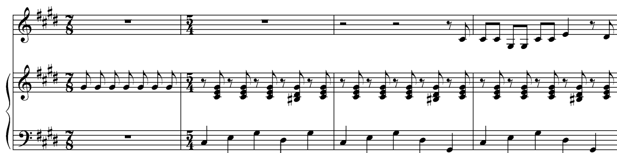
Fig. 4.12. Transcription of opening of "There Are Girls" by Lehaqat Hanachal. 81

Musically Blumin's version of the song is more complex than the original one by Lehaqat Hanachal. The latter is in the popular music vein, emphasizing its satirical nature with a fast rhythmical accompaniment (168 beats per minute) played on the accordion (fig. 4.12). Blumin's version, on the other hand, is closer to art music in its sophistication. It is heavier and more dramatic (although the tempo is the same), with a complex rhythmic pattern in the bass (fig. 4.13). While the original keeps the same rhythm throughout, Blumin's accompaniment changes to reflect the text. The chorus has a dramatically different texture that illustrates the way Blumin is mocking the narrator's self-righteousness (fig. 4.14). Blumin's sophisticated cover of a popular song offered her audience highbrow art and classic Israeli culture, while the way she over-dramatized the lyrics and poked fun at her own culture downplayed the elitist overtones.