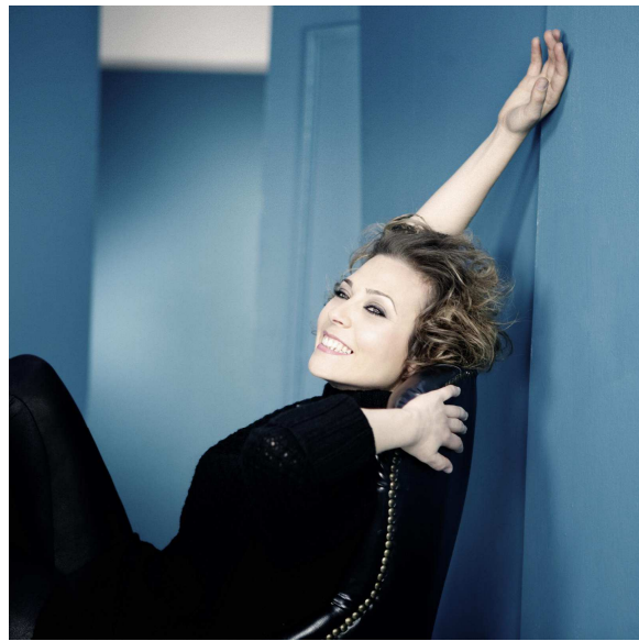
Fig. 2.15. In her album All My Faces Awad emphasizes her European persona.