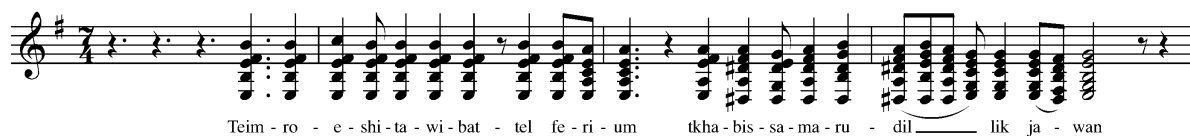
Fig. 2.4. Transcription of the opening of “After All the Rain,” spotlighting the sonorities of a Bulgarian women’s choir.

The Bulgarian aspect of “After All the Rain” lends it foreignness. The first sound on the album track is that of a Bulgarian women’s choir, unaccompanied women’s voices singing in close harmony with a distinctive full-throated vocal timbre (fig. 2.4). The abundance of minor seconds that are sung simultaneously creates a dense texture that is very different from Western pop music. For Awad, Bulgarian music feels close to home, unlike Arab music technique, which she learned later in her career. She has an affinity to Bulgarian women’s choirs, since her mother sings in one. As she described, “In my eyes it doesn’t sound like there’s a problem. No it’s a minor second. And I’m like, so? It sounds good, no? And then, you get it, people are like, yes, it sounds good, it’s just compressed. So?” 9 By “compressed” Awad is referring to the density of the vertical harmonies. Although the Bulgarian State Radio and Television Female Vocal Choir is very popular in Israel, Awad foregrounds the unusualness of the sound within her milieu, marking herself as Other by naturalizing it.