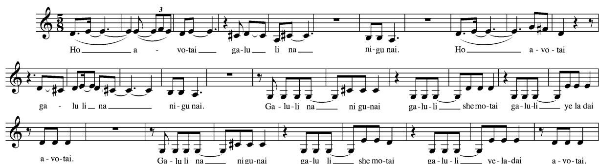
Fig. 5.3. Transcription of the verse melody of “My Forefathers” combining jazz and Middle Eastern music

The tonality of the bridge indexes Middle Eastern music more specifically (fig. 5.4). In this situation Middle Eastern music represents roots, rather than Otherness, as it does for Awad and Dikla. The first phrase could be in maqam Hijaz on A, the second Nahawand on A, and the third Kurd on A (fig. 5.5). The way the melody moves through them, however, is not the modulation of Arab music, pivoting and combining tetrachords, but instead Aviv plays with the second and third degrees of the scale like a jazz musician, in the same way she combined the two forms of Mixolydian mode. The coda in Hijaz on A foregrounds the Middle Easternness, enhanced by Sela's zurna, a distinctive loud Turkish reed instrument.