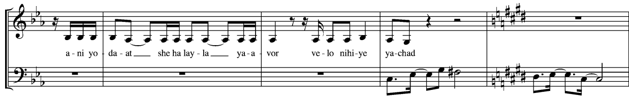
Fig. 3.17. Transcription of Euro-American pop style modulation in “Melodies.”

The aspect that most readily identifies “Melodies” as Middle Eastern on the recording is the instrumentation: darbuka, riqq, qanun, and violins. In live performance, however, there are no ethnic instruments, so her music sounds like Western rock. As one critic suggests, “If we strip the songs of their arrangements, they could easily have become mainstream Israeli hits, but would also lack some distinctiveness and charm” (Katri 2010). The presence of Middle Eastern instruments onstage is a powerful visual cue in indexing an ethnic tradition, more so than sound alone. Indeed, when I first saw Dikla at Levontin I wondered why she was called the diva of Hebrew-Arabic rock.