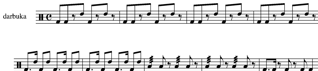
Fig. 2.14. Transcription of Israel Kimhi’s drum solo during “Bukra” at Jaffa Port that brought out the Middle Eastern aspect.

The music video of “Bukra” depicts Awad’s contemporary Israeli Arab identity rather than the timelessness of “Daylight.” There are scenes of children on a basketball court dressed in school uniforms, as cheerleaders, and as a jockey. I interpret these images to represent the future. Similarly, I read as symbols of peace the images of whirling dervishes wearing white, which changes to red, white, and green, the colors of the Palestinian flag.