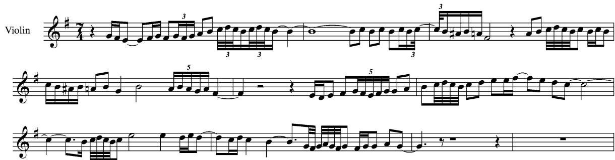
Fig. 2.6. Transcription of Sania Kroitov's violin solo in "After All the Rain" fusing musical traditions.

The combination of Bulgarian sonorities and Arabic lyrics posed a challenge for Awad in recording the song.