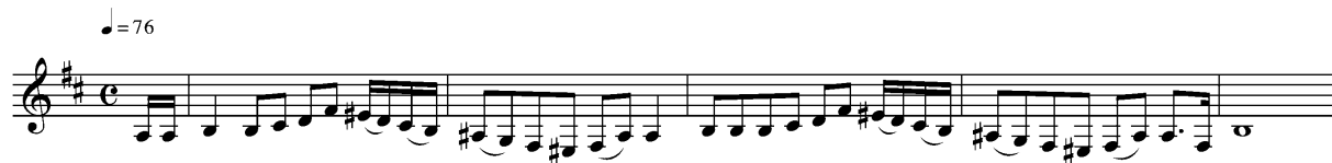
Fig. 2.9. Transcription of the opening melody of "Daylight and My Heart" as legible and accessible Arabness.

Awad's vocal style was typical of Western pop rather than classical Arab music. The tonality further supports the Middle Eastern aspect by being in Maqam Nakriz, here transposed from C to B, with two augmented seconds, but no quarter-tones, so that it evokes an Arabness that is accessible and legible (fig. 2.9). It is the instrumentation, however, that gives the song its haunting quality, the stark accompaniment of tar and nay. The sound world of hand drumming contrasts dramatically with sticks on a drum set, typical of most popular music. In live performance Seri sometimes extended the percussion solo to bring out the Middle Easternness. At "Speaking Art" Seri's percussion solo was 1'00" as opposed to 44" at Café Bialik. The longer break gave Awad a chance to dance more, which she did with belly dance moves that I had not seen at her do at Café Bialik. 20 During the solo the energy also built up enough that the audience started clapping along, turning it into a highlight of the show.