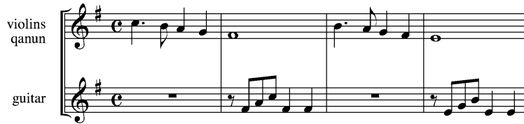
Fig. 3.7. Transcription of lazimas played by electric guitar in “Obsession” evoking musika mizrahit

The melody is in regular four-bar phrases, common in Euro-American pop music, but also frequent enough in Arab music. The repetition and predictability do not present obstacles to following the music. Throughout this refrain section, both times it appears, the trap set continues the maqsum rhythm, while the electric guitar adds lazimas , reinforcing the predictability, as does the use of melodic sequence (fig. 3.7). The instrumental coloring of the electric guitar would be especially familiar to the audience, since it is prevalent in musika mizrahit .