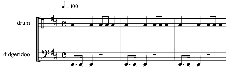
Fig. 2.12. Transcription of percussion and didgeridoo in “Bukra.”

of this rhythm to the Middle Eastern drumming pattern ayyuub (D--kD-T-) 32 in the drum break that was added right before the modulation. During this 20-second darbuka solo, Kimhi played four measures of baladi (DD-TD-T-), followed by two measures of ayyuub, and a measure of clave, which pushed the momentum forward into the modulation (fig. 2.14). Awad preceded the solo with a cry in Arabic and performed belly dance moves during the break. Elsewhere she also added a cry of “yulululu,” the zagharit , or ululation, that women perform in Middle Eastern celebrations.