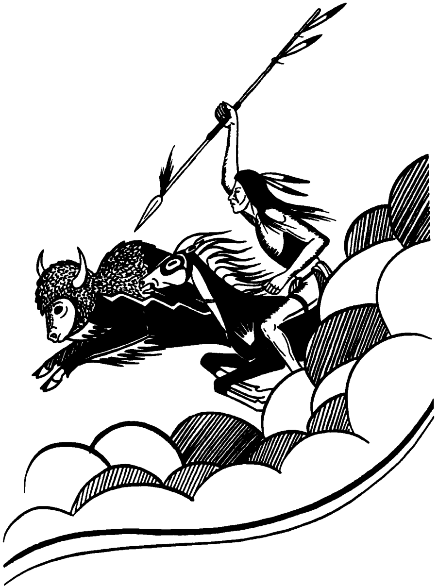
FIGURE 3. A Kiowa Buffalo Hunter.