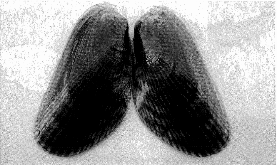
Fig. 2 - Musculista senhousia specimen

The species M. senhousia (Fig. 2) was found in 7 of the 16 sampled sites in the Mar Piccolo of Taranto. The size distribution of the samples is shown in the Fig. 3.