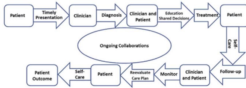
Figure 2. A Multistep Framework of Continuity of Health Care (6) Arrows represent the necessary steps in the continuity of care, ultimately leading to the patient's outcome. Rounded boxes preceding the arrows indicate the person(s) responsible for each step. Adapted from Spertus et al. (6).