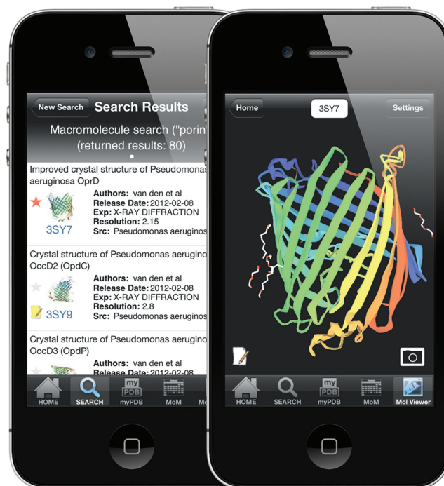
Figure 3. RCSB PDB Mobile. The left image shows the query results from a macromolecule name search for 'porin' on an iPhone. Basic information about each entry is displayed in the results list. Entry 3SY7 has been tagged (red asterisk) and entry 3SY9 (43) has been annotated (yellow note pad icon) in the MyPDB account of the user. Entry 3SY7 in the NDKMol viewer is shown on the right. Structures in the viewer can be rotated, translated and zoomed using finger gestures, and touching the camera icon captures an image. The menu at the bottom allows the user to switch to the search menu, run MyPDB queries, browse 'Molecule of the Month' articles or launch the 3D viewer.

The volume and complexity of PDB data can pose a challenge for users, particularly beginning students.