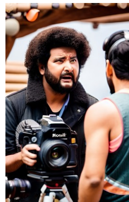
Figure 2. Example picture from the question-answering task (for the idol-idle pair).

Who shouted at the fashion icon that he was quite ugly ?