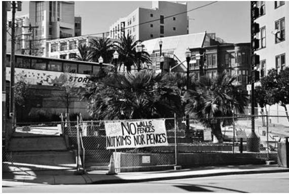
Figure 4. No Walls No Fence Not Kim's Nor Pence's banner, Gay Shame, 2017

tex.” The center has no open, or even semipublic, space, and trans/queer youth of color are regularly removed from the property by force. One of the few times I have been inside the building, a uniformed and armed police officer who was acting as a receptionist confronted a friend and me, demanding that we leave the building because this was “the lobby of a business and not a meeting place.”