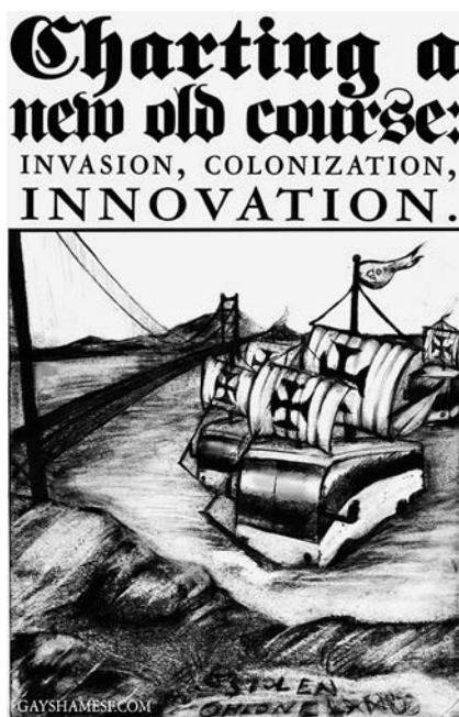
Figure 2. Gentrification and Colonization in the Mission poster, Gay Shame, 2014

ogy from Marx to contemporary tech empires, is announced as the justification for occupation and exploitation, and not its remedy.