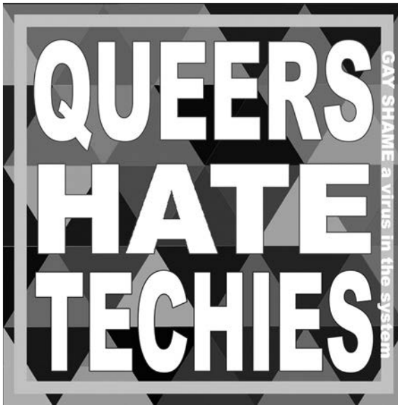
Figure 3. Queers Hate Techies sticker, Gay Shame

“Queers Hate Techies” message is rigorous and strategic. 15 Rather than a call for dialogue —the liberal technic of liquidation by other means—it is the desperate tonality of existing in a world where estrangement and dislocation are the condition of being. For Gay Shame, this sensorium of fear, anger, rage, and hate, felt in common, provides, at least momentarily, a respite from the isolation and exhaustion of living on in a vanishing city.