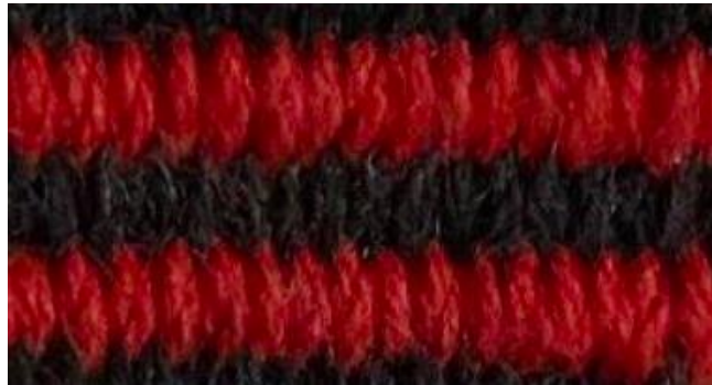
Figure 4. Sample of material woven by the artist then scanned and inserted into the virtual space as the land for Perhaps She Comes From/To __ Alang , 2020.

of a piece of woven fabric that I created during a one-day workshop using the bow-harp technique (Fig. 4). The red dye in the fabric is traditionally extracted from the shoulang yam often found in the high-altitude mountainous areas in Taiwan. Once scanned, this tiny piece of fabric extended the idea of the “woven land” and became the texture of the terrain in the virtual landscape.