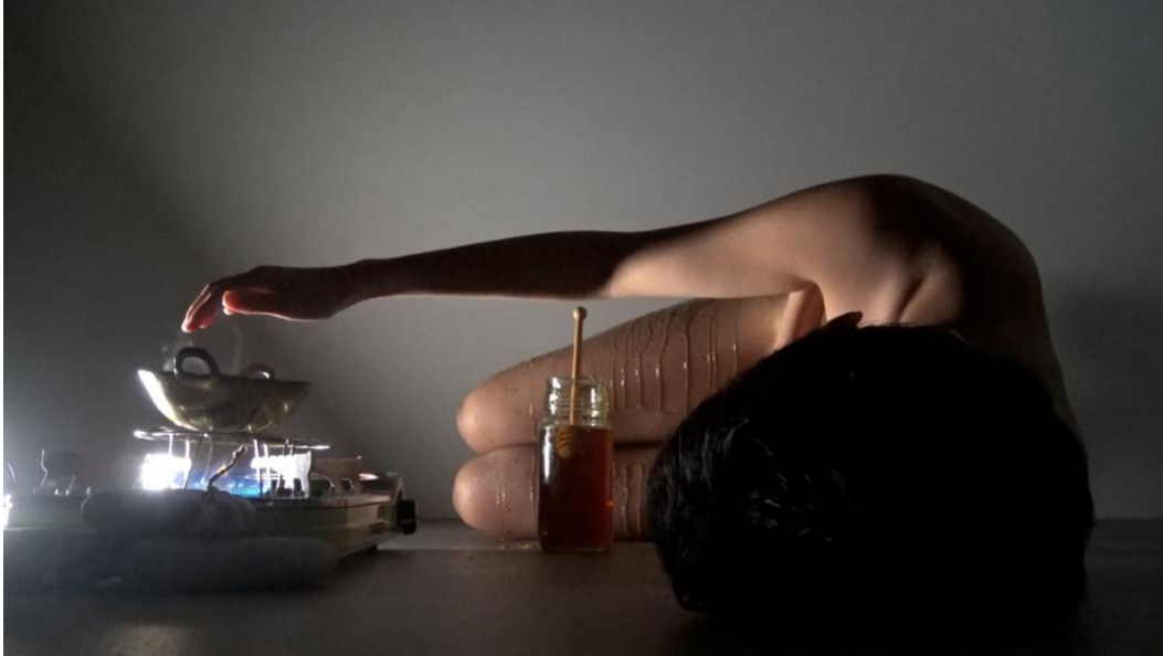
Figure 2. Anchi Lin, video still from Perhaps She Comes From/To ___ Alang , 2022.