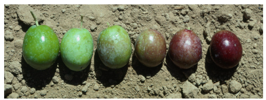
Figure 1. Freshly harvested olives at different stages of ripeness: green-ripe (1 and 2); yellow-green to straw (3); rose to red-brown (4 and 5); and red-brown (6) (may be too soft for some types of olive curing). Not shown are naturally black ripe olives (also described as dark red to purplish black).

Naturally black ripe olives are harvested in California starting in mid-November and continuing through December, depending on the variety, crop yield, and region, and on weather conditions. When mature, these olives will release a reddish black liquid when you squeeze them and their flesh will be nearly completely pigmented. Ripe olives bruise easily and must be handled with care.