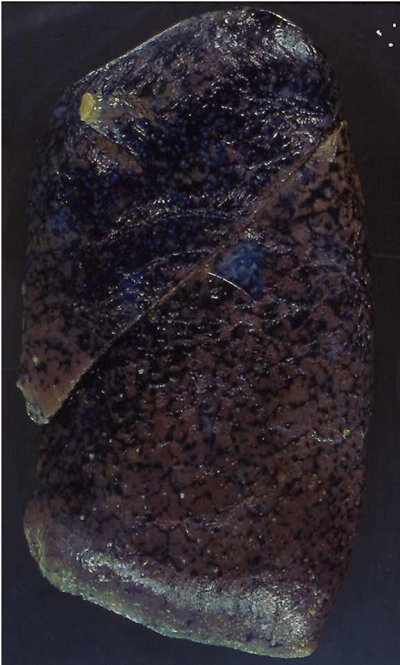
Figure 1 – Anthracotic lung. Inhaled particulates are usually cleared through the respiratory mucociliary apparatus and scavenged by alveolar macrophages. Particles can move into the interlobular septal lymphatics and be cleared by the lymphatic system, but if these mechanisms are overwhelmed, particulates may clog lymphatics and be deposited in the lung interstitium. Ultrafine particles gain entrance to mobile cells and can be transported to all parts of the body. Although this anthracotic lung is characteristic of smokers and workers in dusty occupations, anthracotic deposits are often found in urban dwellers from air pollution.

include Toll-like receptor 4, tumor necrosis factor- \alpha , transforming growth factor- \beta , and many others, have been found to increase susceptibility to the respiratory effects of pollution. 17 Air pollutants affect both the innate and adaptive immune systems. PM disturbs the balance of the Th1 and Th2 leukocyte populations, resulting in dominant Th2 leukocytes, which is a feature of asthma. 19