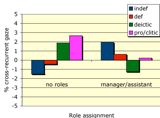
Figure 3 Order of interlocutors' gaze with different kinds of referring expressions: Mean recurrent gaze rates with the negative lags (listener first) less those on the positive lags (speaker first) by dyad role assignments.

To test for this pattern, we examined the shape of the real cross-recurrence curves. Though Figure 2a has clear peaks of aligned gaze at 0 lag (simultaneous), neither figure shows symmetrical cross-recurrence: one side of the tent-like shape is usually higher than the other. By subtracting recurrent gaze where the speaker looked before the listener (positive lags in Figure 1) from recurrent gaze where the listener looked before the speaker (the corresponding negative lags), and averaging the results, we can characterize aligned attention for each of the four accessibility levels within each role type. In Figure 3, negative values mean that listeners followed speakers and positive values mean that listeners preceded speakers.