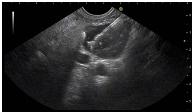
Figure 2. Endoscopic ultrasound showing an oval and anechoic cyst in association with the tail of the pancreas. Biopsies of the cyst wall were performed using the through-the-needle microforceps.

retroperitoneum. Novel, in this case, is the use of the through-the-needle microforceps for diagnosis. This is the first case of any foregut duplication cysts diagnosed using the microforceps.