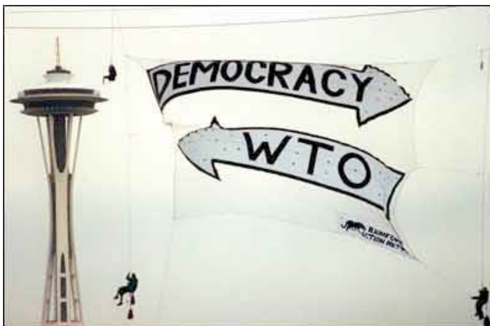
Figure 2. Protest at WTO Ministerial Conference in Seattle.

The case brought by Antigua seems to illustrate the concern perfectly. Antigua challenged a host of American laws that regulated an activity that many found morally repugnant and even dangerous. Antigua even challenged criminal convictions based on these laws. 95 Antigua argued that the United States had failed to open gambling to international competition by maintaining and enhancing state and federal laws that effectively prohibited gambling services from outside the United States to American consumers. It asserted that in so doing the United States violated its commitments under GATT to open “entertainment” and “other recreational services.”