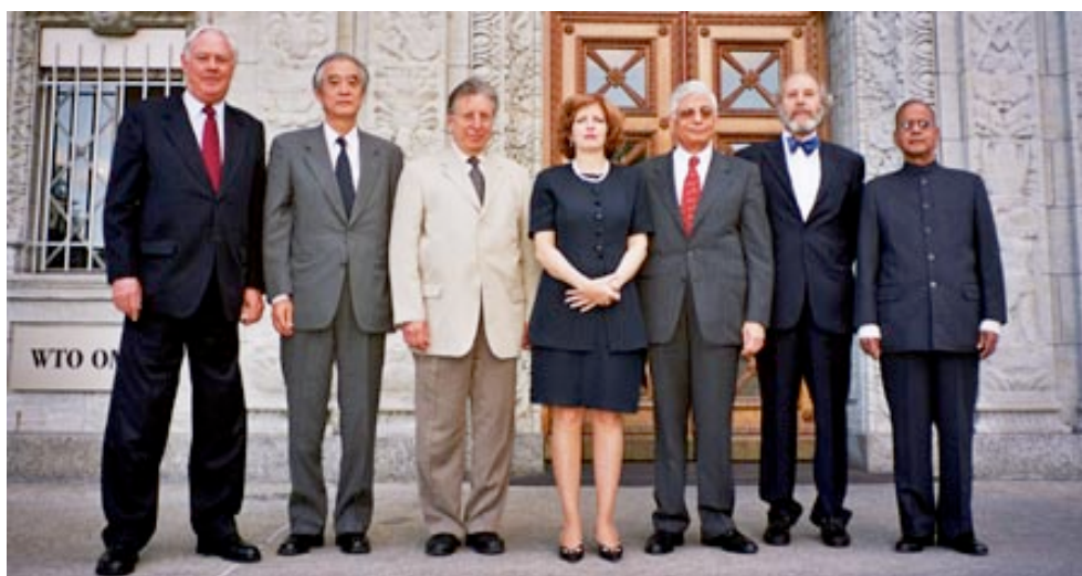
Figure 1. A World Supreme Court? The Appellate Body of the Dispute Resolution Body of the World Trade Organization.

“We know what the people imagine,” Bickel wrote. “They imagine that they rule themselves...” 2 But a judiciary empowered to overrule on constitutional grounds the judgments of the political branches renders self-rule an illusion. Bickel thus articulated the principal challenge of the last half-century to judicial review.