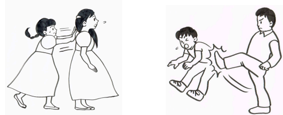
Figure 1: Hand related and non-hand related events