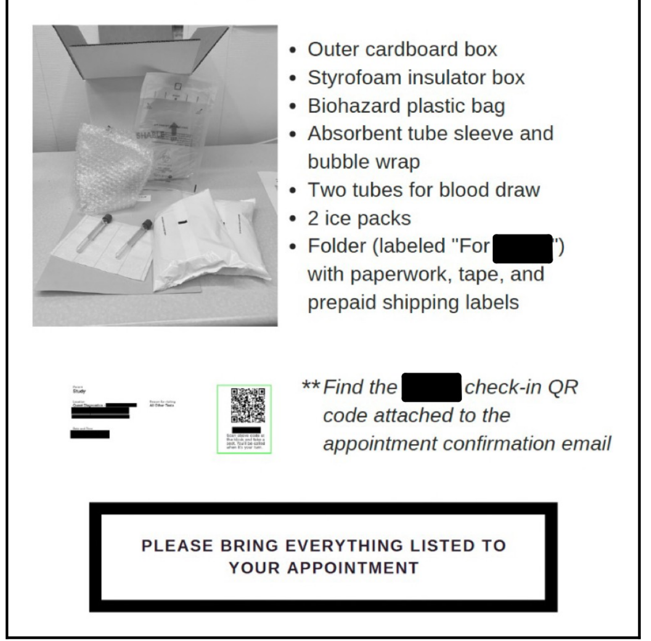
Figure 2a: Participant FAQ sheet