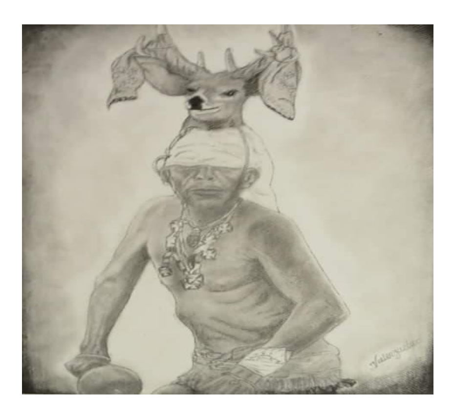
Figure 5 (Illustration 4, Lu'uturia: Culture)

are nomads, that we moved). 8 (They say that we never had a home, the truth is that they want to steal our land). 9 (They will say that we have never settle, that we migrated, that our home is non-existent, that we were ignorant ones who lived in the mountains and in caves. They say, we took over this land by force, that we do not want to leave, what is our homeland, our Rio Yaqui). 10 (My relatives, it is very important that we never forget where we come from in order to honor our ancestors).