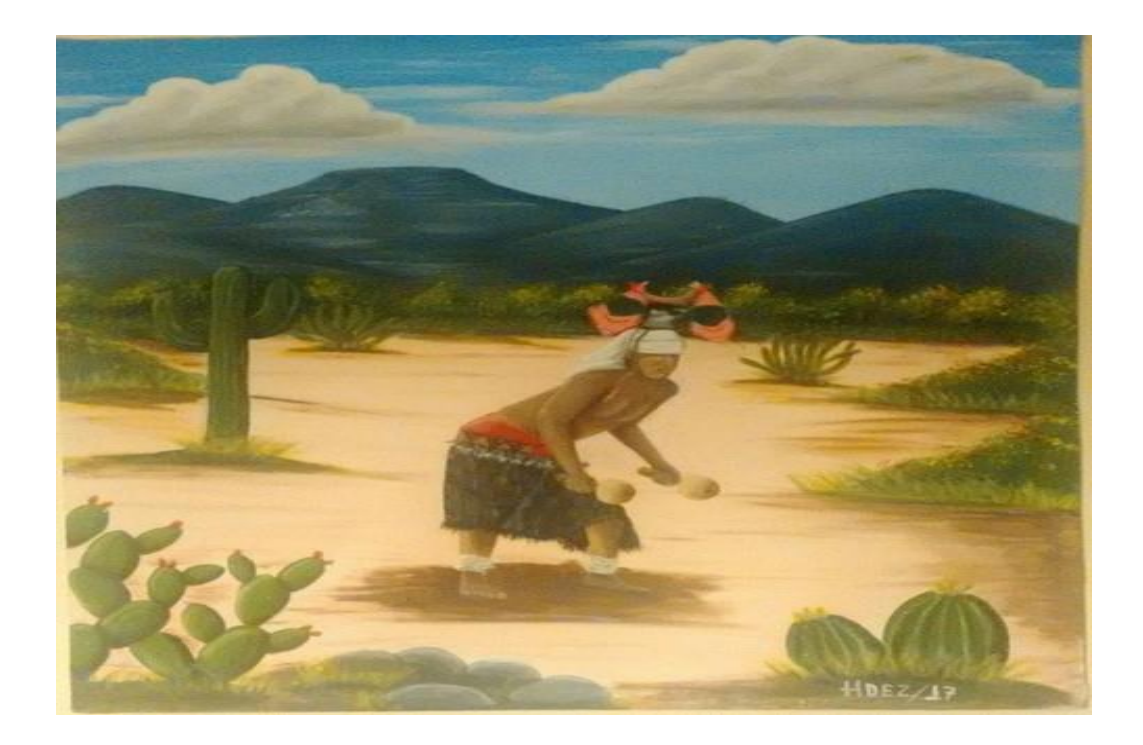
Figure 4 (Illustration 3, Lu'uturia: Culture)

To give the audience some context I have included examples of the game. The following square, Yo'em Lu'uturia: Culture- Huya Ania (the wilderness world), is an example of one of the many sections dealing with culture and worldview gamers will come across while playing the game. This example was chosen among an array of cultural and linguistic examples to showcase the many ways in which discourse, storytelling, history, culture, and resistance intertwine together in Yo'eme use of language and cultural practice. To demonstrate, let's examine questions in the square of culture: Yo'em Lu'uturia