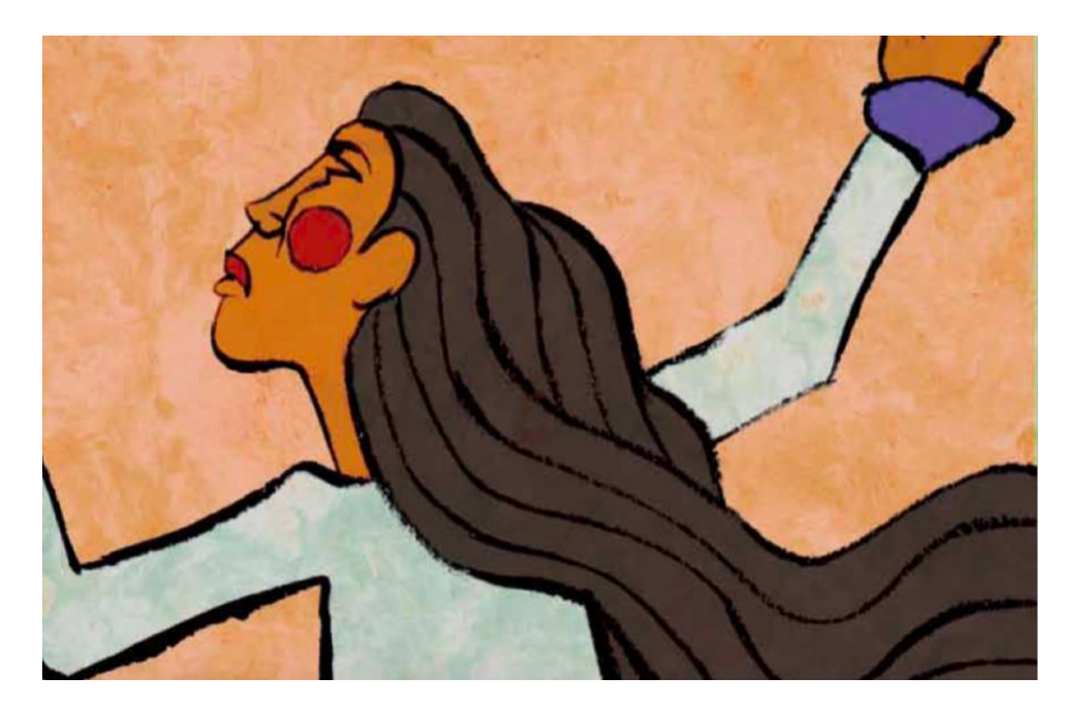
Figure 8 (Illustration 7 Susuama: Storytelling)

reversal of traditional practices and institutions within the community. Resulting in a greater influence of dominant society ideologies influencing the distortion, discontinuation, and questioning of traditional structures. Intrinsic to these processes, as Native anthropologist Shannon Speed has articulated, colonialism's 'current iteration-neoliberalism' has incorporated the proliferation of values shaped by the 'settler colonial imperative of dispossession, extraction, and elimination" (Speed 2019:24) Taken together, these factors, have the effect of rethinking the roles and social relations between genders and generations, producing changes in the perceived structure of Yo'eme society. To better understand Yo'eme agency and resistance rooted in traditional practices let's examine a sample square in the culture and language board game.