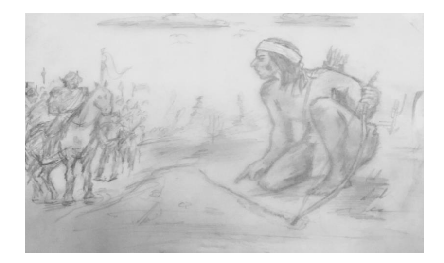
Figure 7 (Illustration 6 Namakasia : Resistance- the strength and resilience of the ancestors). Namakasia: Resistance

Namakasia (sample question from intermediate level)