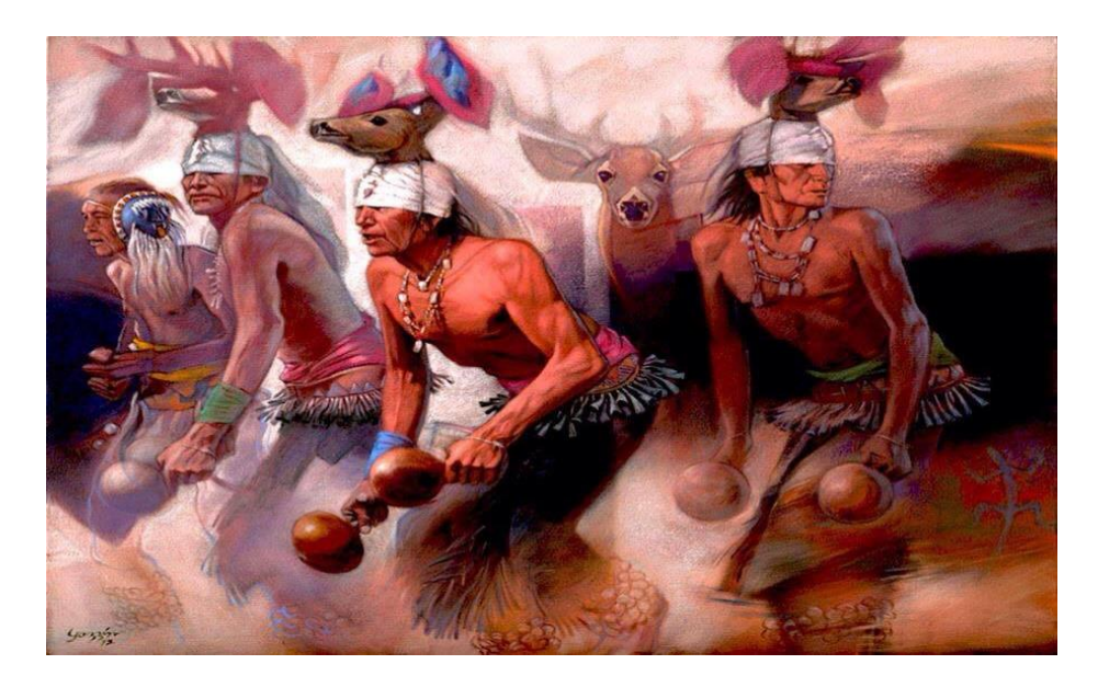
Figure 6 (Illustration 5: Vat' nataka into ian weria: History) Yo'eme history (novice category)

1) Why is September 18, 1978, a day to remember for Yo'eme in the United