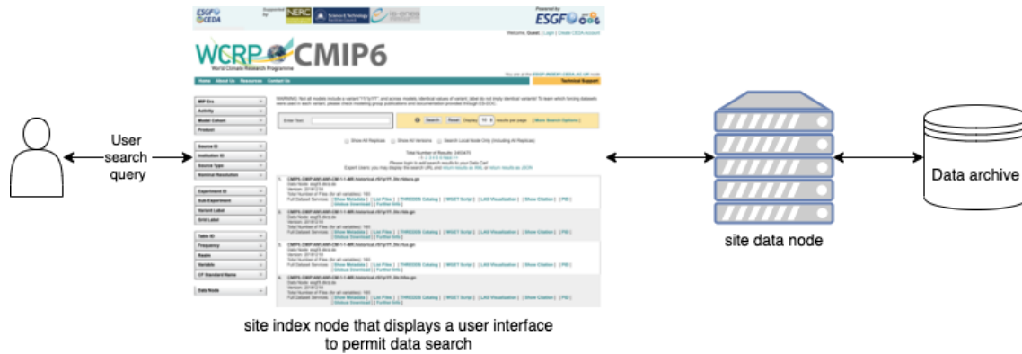
Figure 3. The ESGF data search and delivery system schematic.

web page screen shown in Fig. 3. Each dataset that matches a given set of criteria is displayed. Users can further interrogate the metadata of the dataset or continue filtering until they have found the data that they wish to download. Download can be via a single file, a dataset or a basket of different data to be downloaded. In each case the search (index) node communicates with the data server (an ESGF data node), which in turn communicates with the data archive where the data are actually stored; once located, these data are then transferred to the user.