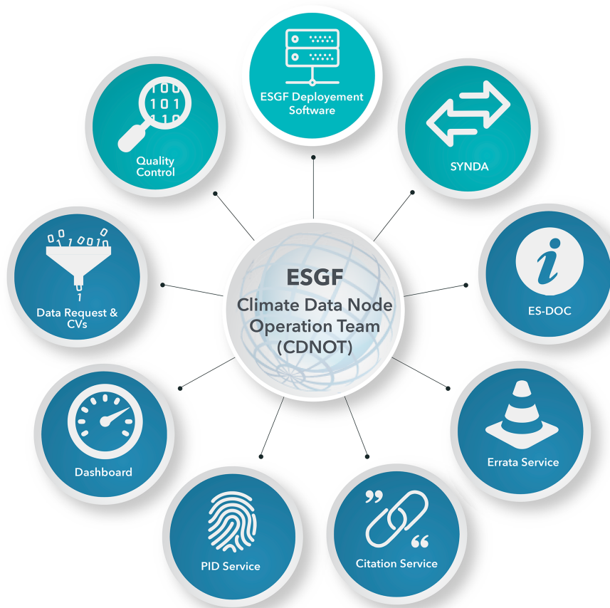
Figure 4. Schematic showing the software ecosystem used for CMIP6 data delivery. Note the darker blue bubbles are those that represent the value-added services.

May 2020), which was extended with hundreds of new terms to support CMIP6.