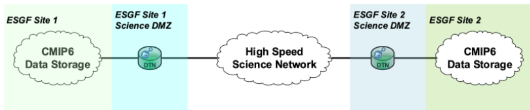
Figure 6. Data transfer architecture.

users' local computing environment. Sites that are unable to fulfil the recommendations completely, for any reason, such as lack of technical infrastructure, expertise or resource are likely to have a degraded performance in comparison to other sites. The degree to which it is impacted is reflect in how far the deployed infrastructure deviates from the recommendations outlined in this section. In this respect, it is important to remark that the CDNOT has recommended this deployment as best practice, but it cannot be enforced; however the CDNOT and its members continue to try and assist all sites in the infrastructure deployments.