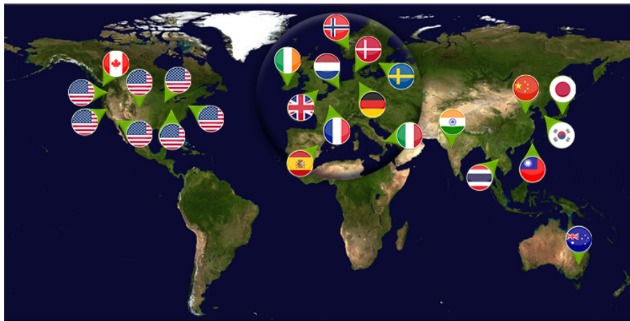
Figure 2. Geographic distribution of Earth System Grid Federation sites participating in CMIP6 as of April 2020. The figure was generated using a world map taken from Shutterstock, and the country flags are taken from Iconfinder.

in practice this has never been necessary). Anyone can take a copy of a subset of data from ESGF; if these are not re-published to the ESGF, these mirrors (sometimes referred to as “dark archives” as they are not visible to all users) are not guaranteed to have the correct, up-to-date versions of the data.