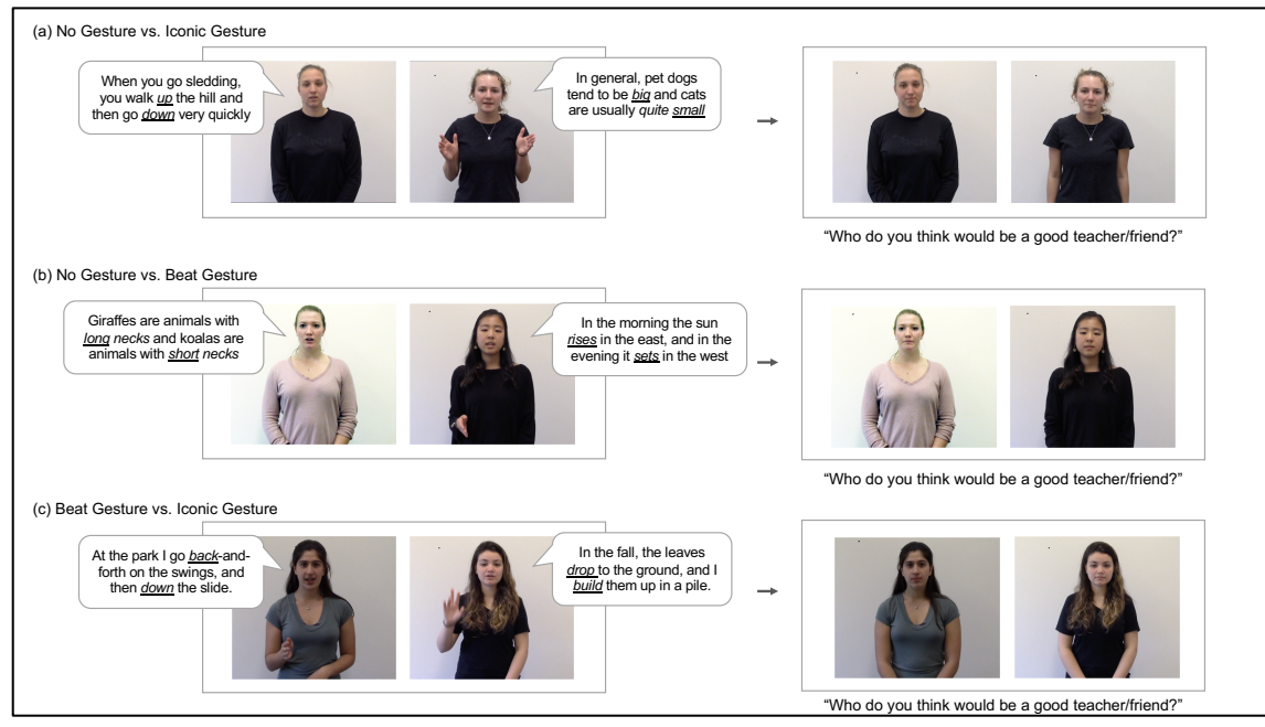
Figure 1: Examples of the three trial types presented during the alternative-forced-choice task.

with drop depicted the downward motion of leaves (moving the hands downwards while wiggling the fingers), and the gesture produced simultaneously with build them depicted building a pile of leaves (moving the hands towards each other and upward; palms-in). In beat gesture videos, the actress produced two beat gestures accompanying her statement. These rhythmic downwards hand motions were produced at the same points in the statement as the iconic gestures were performed. Each actress stated the same fact in her three videos, and the same audio file was used for all three videos, ensuring no differences in emphasis or inflection. Each actress made a different statement (see Figure 1).