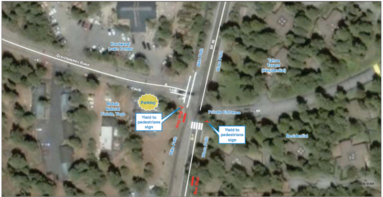
Caltrans Tahoe Crosswalks GRANLIBAKKEN ROAD AND SR 89