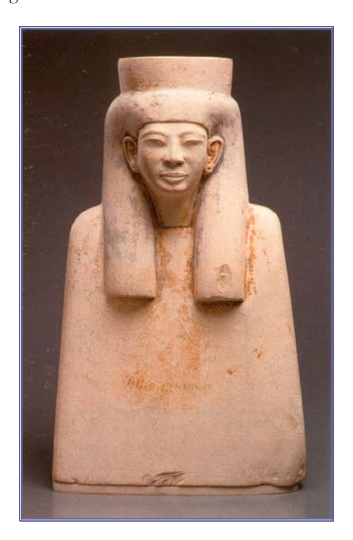
Figure 2. Large (262 mm) limestone ancestor bust with wig and modius, possibly from Deir el-Medina, late 18<sup>th</sup>-early 19<sup>th</sup> Dynasty.