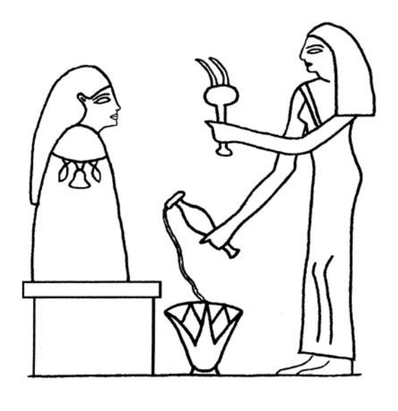
Figure 3. Limestone stela depicting the Lady of the House, Henut, offering incense and water to an ancestor bust. From Deir el-Medina.

The presumed use and meaning of the busts have been influenced by the assumption of a predominantly domestic context hampered by the fact that only four of the 150 examples are inscribed (Keith-Bennett 1981a: 48 - 50). Friedman (1985) has argued that the busts constituted the focal point of the ancestor cult rites, thereby continuing the tradition, documented since the Old Kingdom, of the living presenting offerings to the recently deceased. According to this interpretation, the busts represented or embodied the 3h-jkr, the "excellent spirits," to whom the 3h-jkr n R<sup>c</sup>-stelae were also dedicated (Demarée 1983). The anepigraphic busts at Deir el-Medina were identified by associated inscribed objects, such as the headrests, offering tables, and 3h-jkr n R<sup>c</sup>stelae found alongside them. A variant suggestion (Harrington 2003) argues that the majority of the busts represent women (based on the presence of the tripartite wig) and form the counterpoint to the 3h-jkr n R<sup>c</sup>-stelae, which are almost wholly dedicated to men. These interpretations also place the busts within the network of artifacts associated with