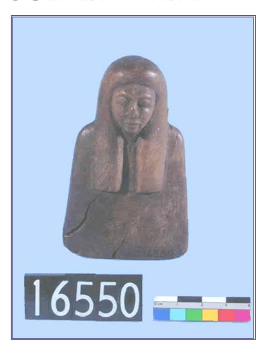
Figure 4. Unprovenanced wooden bust wearing a wig.

the ancestor cult, centered on the concept that the recently deceased could impact—positively or negatively-on the living. Included in this network of artifacts are the Letters to the Dead, which gave voice to the concept. The busts were tangible intermediaries between this world and the world of the supernatural, of the dead and the gods, and provided magical protection for the living (Meskell perhaps 2003: 46)—protection being especially pertinent at Deir el-Medina, where many of the men worked away from the village much of the time. However, it is possible that the busts had additional cultic functions that have yet to be defined (Keith-Bennett 1981a: 50). The anonymous nature of the busts would have allowed them changing contextual identifications and functions. "Anthropoid bust" may be a more appropriate term for these artifacts.