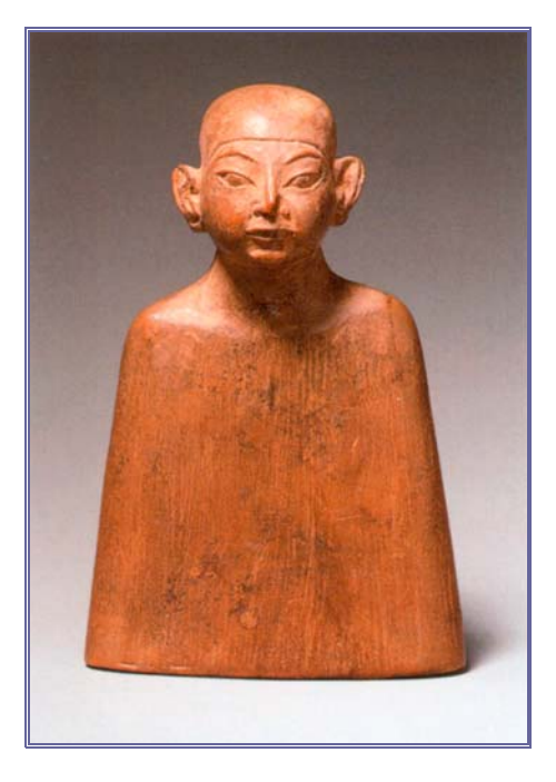
Figure 1. Small (78 mm) wooden ancestor bust without a wig, from Deir el-Medina, 18th Dynasty, reign of Akhenaten.