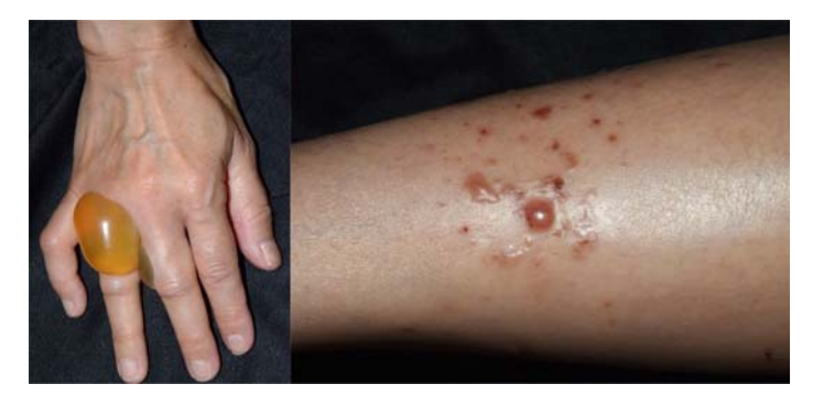
Figure 1. Tense bullae on the hands and lower legs.

weeks of treatment initiation without the use of immunosuppressive drugs.