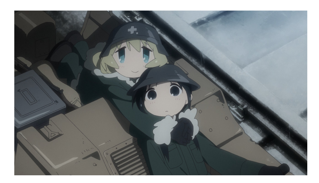
Figure 2.1: Yuuri (light hair) and Chiito (dark hair) from the Girls' Last Tour television show.

buried treasure in the desert). The two eventually bond as they look for the rumored treasure and much of the run time is spent exploring their relationship and the baggage each of them are carrying with them. In terms of tone and content, Tracks in Snow leans closer to Highway Blossoms than it does Girls' Last Tour as my main focus with the story has been the relationship between the game's two characters, Chiara and Rika, though like Girls' Last Tour , the relationship is ongoing rather than newly formed.