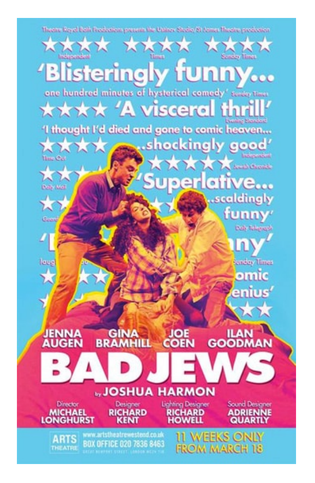
Figure 2.3: The, according to Transport for London, offending poster for Bad\ Jews' 2015 production.

York Jews and the white, Christian values of Broadway theater [31]. Almost a hundred years later, another Jewish play would run into similar, if less punitive, claims of offence across the Atlantic Ocean.