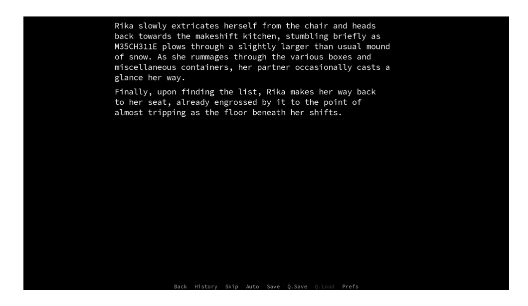
Figure 1.2: One of the scene transitions in Tracks in Snow . These purely text moments exist both to give players a chance to rest and reflect on the scene they just played through as well as allow for more physical action to happen beyond the confines Puppitor places on the dialogue scenes.

writing a stage play. The main focus of the script itself is structure and dialogue with a few differences from my other plays to accommodate the gesture focused mechanics and player defined pacing. In the main, dialogue oriented parts of the game, the stage directions are mostly there to provide sound cues, in contrast with how I frequently have important actions, in addition to effects cues, in the stage directions in my more traditional scripts. Where these actions wound up is in the scene transitions which do not feature any dialogue and provide a place for players to take a break from performing characters as well as shift the context into the next scene as shown in Figure 1.2. At one point, before the pandemic made it impossible, I had thought having a production, or at the very least a dramatic reading, of the script alongside the digital version would