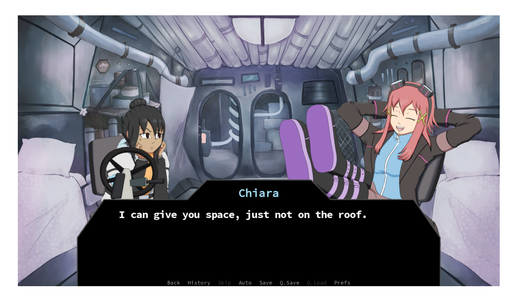
Figure 1.1: A screenshot of a moment in the current version of Tracks in Snow where Chiara (left) is expressing anger while performing her projected energy gesture and Rika (right) is expressing joy while performing her open flow gesture.

help facilitate the development of visual novels. As a result all the tools supporting the Tracks in Snow , namely Puppitor (further summarized in Section 1.2), are also written in Python. Before I keep going I just want to take a moment to appreciate Ren'Py for letting me do a bunch of things to it that I don't think it was ever supposed to be doing, and it let me <sup>5</sup>.