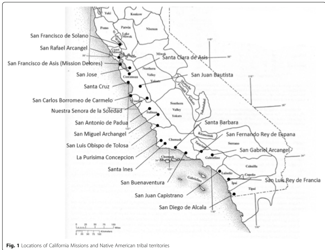
Fig. 1 Locations of California Missions and Native American tribal territories

herbs used by the Native Americans were collected from around the Missions [21], while Spanish medicinal supplies were shipped periodically to California from Mexico [7]. The quantity of medicinal supplies imported from Mexico often became inadequate to treat the increasing number of neophytes succumbing to both native and exotic diseases. At times of shortages of medical supplies, the priests and enfermeros exchanged knowledge of medicinal plants to broaden the supply of medicines to treat the sick [26]. Neophytes were sometimes dispatched by the priests to collect medicinal plants from the wild (Engelhardt 1922).