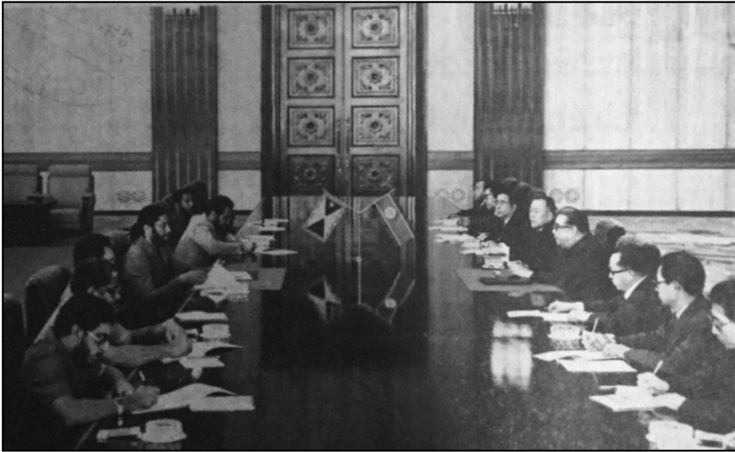
Figure 1. Talks are held between President Kim Il-sung and Prime Minister Maurice Bishop.

Strachan added, “The way music was utilized to drive the workers was impressive.” When he first saw the hospital, it was only half complete, and in a matter of days, it was completely finished. The “efficiency” of these workers impressed Strachan. The precision of the North Korean Mass Games also captivated him, and he remarked that the “training was amazing.” Strachan unsuccessfully tried to bring North Korean-style gymnastics back to Grenada. 16