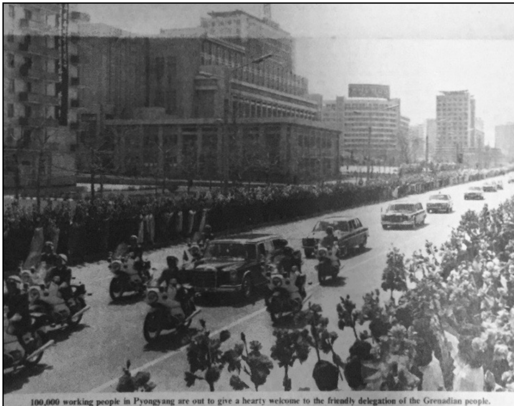
Figure 3. North Koreans line the streets of Pyongyang to welcome the Grenadian delegation.

During Maurice Bishop's visit to the DPRK, one hundred thousand North Koreans lined the streets of Pyongyang to enthusiastically welcome the Grenadian delegation, and a welcome banquet was held at Kumsusan Assembly Hall on April 10 in which the North Korean and Grenadian leaders spoke (figure 3). Kim Il-sung praised the "triumphant advance of the Grenadian revolution [which] patiently proves that Latin America is no longer the 'tranquil backyard' of U.S. imperialism and that the new era of chajusong [independence] when the masses are masters of history is forcefully unfolding in this part of the world as well." 29 Bishop, in his speech, celebrated the four years of close relations between the PRG and DPRK governments and commended Kim's Juche ideology. Bishop said that North Korea's successes in industry, agriculture, health, and education are attributable to "your Party's progressive and enlightened principles embodied in the Juche Idea which so correctly guide your political, economic, and social policies." 30