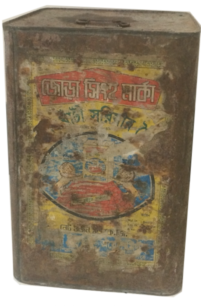
Fig. 1. Example of a lead-soldered can. The lead is visible near the top seam of the can.

years. Lead-free alternative storage containers like plastic containers were considered to be acceptable and were increasing in popularity and availability despite some minor disadvantages ranging from strong plastic smells to less efficient pest deterrence. Respondents mentioned door-to-door salesmen were selling high-quality, affordable, plastic containers, making them the easiest to procure.