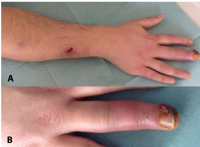
Figure 1. Clinical presentation. A) Inflammatory signs on the third right finger and an ulcerated nodule in fingertip are seen. B) Red-to-purplish ulcerating nodules on the dorsal aspect of the right forearm following a lymphocutaneous (sporotrichoid) pattern.

In view of the clinical picture, our suspected differential diagnosis included sporotrichosis, atypical mycobacteriosis, and cutaneous tuberculosis. Given the hobby-related risk factor, M. marinum infection was considered likely to be involved.