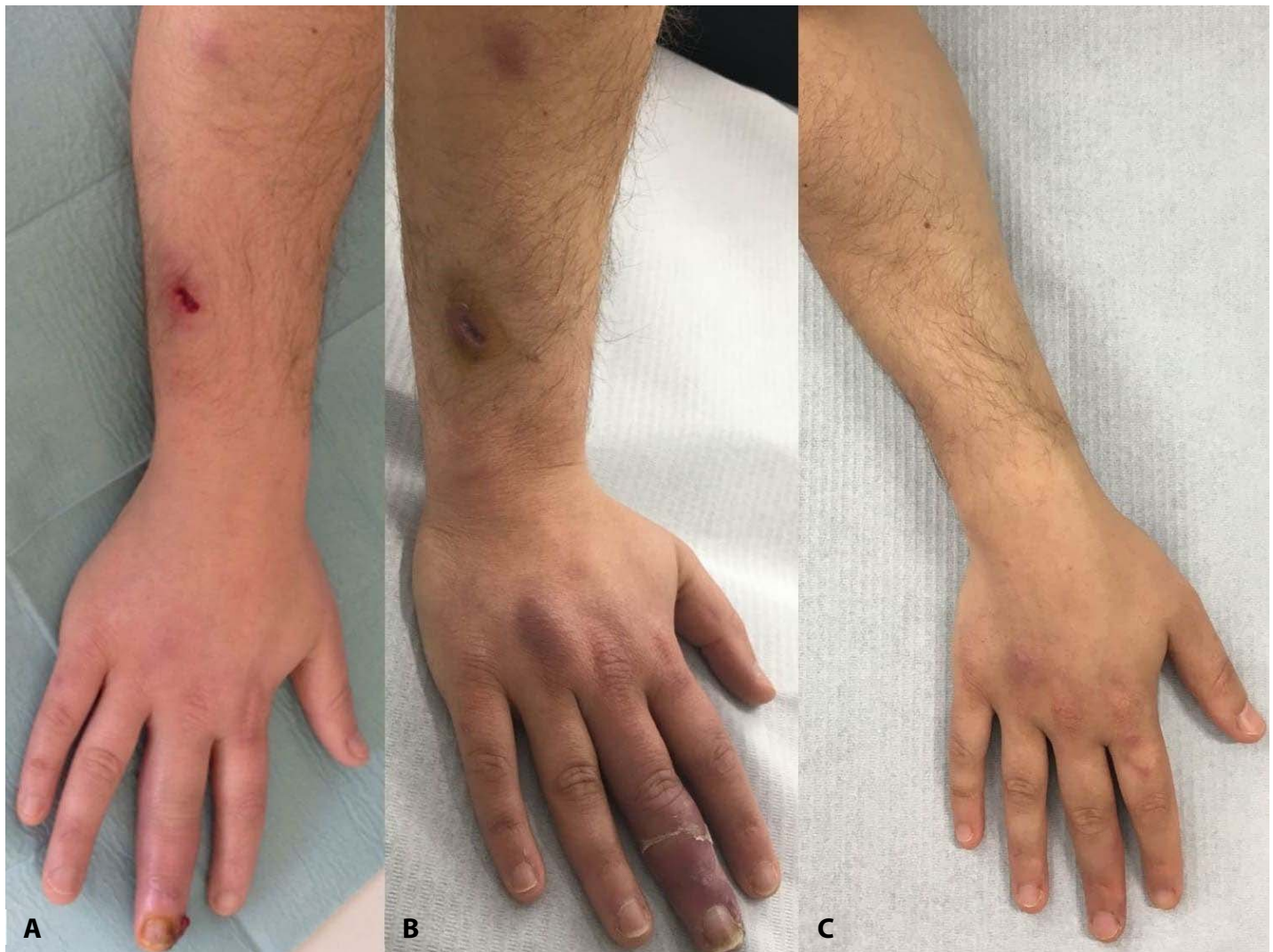
Figure 3. Clinical follow-up. A) Initial picture, before treatment. B) Two weeks after starting treatment, a significant clinical improvement is seen with clearance of the inflammatory signs. C) Complete resolution, by the end of the treatment course.

The patient was treated with clarithromycin, 500mg twice daily, rifampicin, 600mg once a day, and ethambutol 25mg/kg once a day (1.2g a day) orally. After two weeks of therapy we observed marked remission of the infection with clearance of the inflammatory signs ( Figure 3 ). The patient completed 9 months of treatment with complete clinical resolution, no sequelae, and no adverse effects ( Figure 3 ).