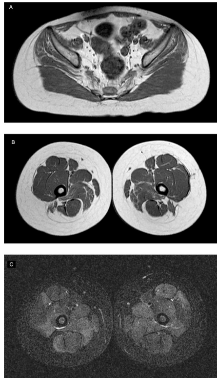
Fig. 1. Initial presentation: MRI of the lower extremities. Axial T1 through the pelvis (A) and lower extremities (B) show minimal atrophy of the gluteus medius and minimus muscles, otherwise, no significant atrophy of the muscles. Axial STIR (C) at the level of the femur show heterogeneous hyperintensity throughout the muscles.