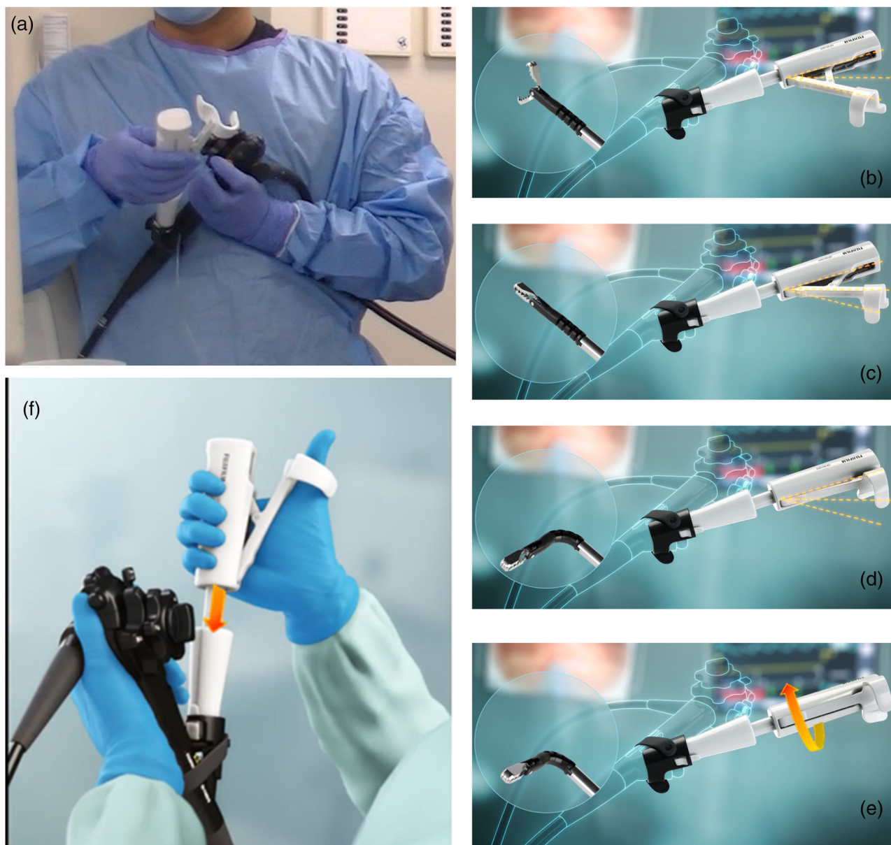
FIGURE 2 The traction device used in this study (Tracmotion; Fujifilm, Lexington, MA, USA) is a single operator, a through-the-scope device with 360° rotatable grasping forceps that can be opened and closed repeatedly to allow tissue manipulation and traction during submucosal dissection (a). The opened handle position opens the jaws of the grasping forceps (b). Closing the handle halfway results in the closure of the jaws of the grasping forceps (c). A fully closed handle bends the grasping forceps towards a 90-degree angle (d). Rotation of the handle translates into rotation of the grasping forceps (e). Pushing down on the handle (arrow) further extends out the grasping forceps (f).

3.7 mm or larger instrument inner channel diameter and a working length of 1030 mm.