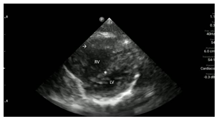
Image 3. Parasternal short-axis view of the heart notable for interventricular septal flattening (*) due to right ventricular pressure overload in the setting of right ventricular hypertrophy (arrow). LV, left ventricle; RV, right ventricle.

assessment of the inferior vena cava showed a noncollapsing vessel.