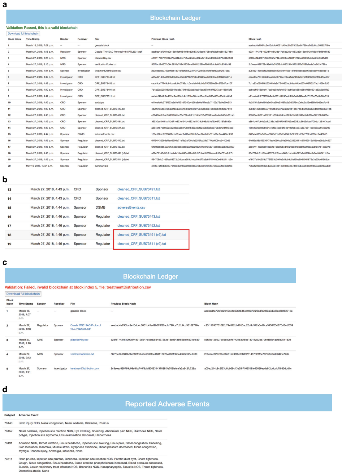
Fig. 3 Portal functionality. a The public ledger shows the full transaction history since the start of the trial. Blocks are timestamped, indexed, and attached with the file of the transaction and identities of the participating parties. The regulator can easily download individual files, or all elements in bulk, and inspect when and between whom files are shared. b New versions of files are given a version number, which increments with each new version of that file. In the screenshot above, the original CRF was modified by the sponsor and automatically appended with a (v2) by the system (boxed in red). The responsible party and time of modification are readily apparent. c Internal validation and automated hash checks take place to verify the integrity of the data without the need to manually read through the data's contents. Hash checks are performed chronologically starting with the genesis block, and verify that the hash of the contents of the block match what is to be expected (see Supplementary Methods). Validation fails when the treatmentDistribution.csv is modified at the storage level. The precise origin and location of the fault can be readily discerned. d Adverse events are auto populated from investigator uploaded CRFs to the pages of the regulator and DSMB, circumventing the normal, slower, and more error prone pathway that is normally taken for adverse event reporting. Such instances are available for inspection at the soonest possible time