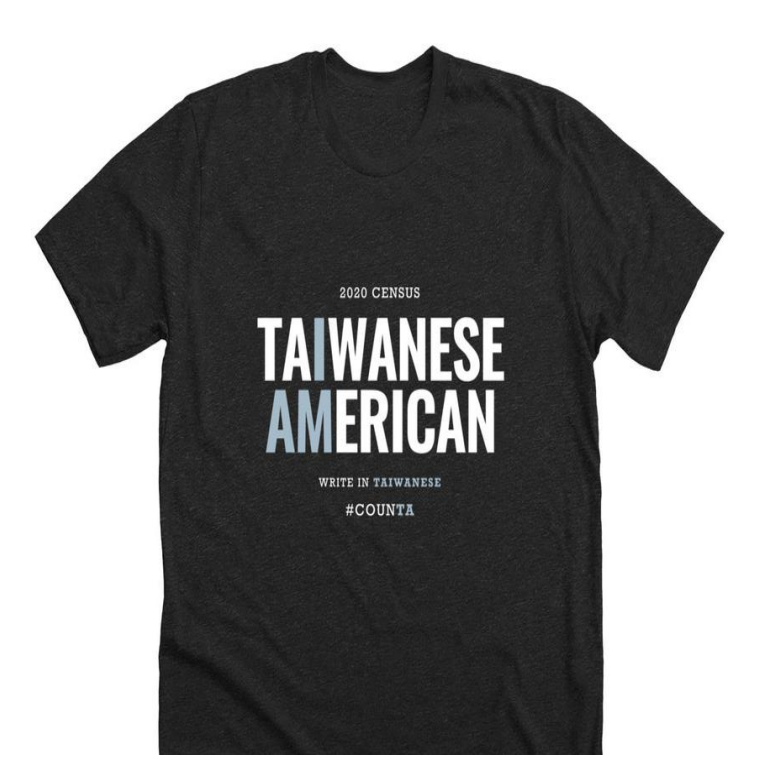
Figure 2: "Taiwanese American" T-Shirt

forms. The campaign sold merchandise that enhanced the visibility of Taiwanese America, such as t-shirts, mugs, and flags. One of the most popular items for sale was a T-shirt highlighting "TAIWANESE AMERICAN" in capital letters, as shown in Figure 2. This shirt allows Taiwanese Americans to show their cultural pride for Taiwan and the Taiwanese American community while raising awareness of the significance of the 2020 census write-in campaign.