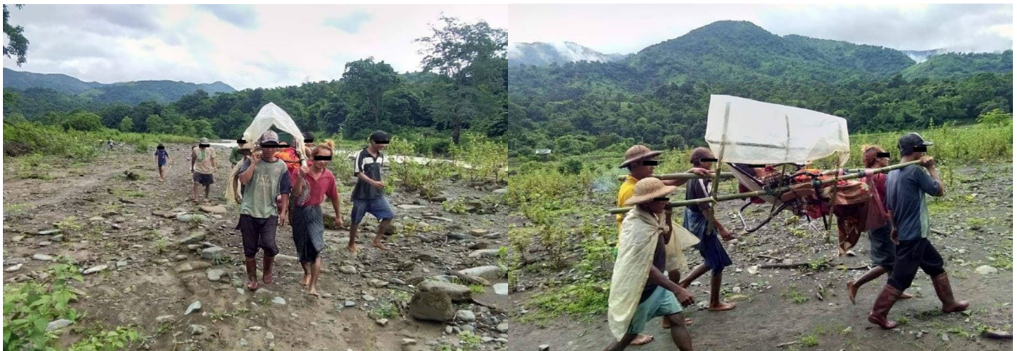
Figure 2. Common transportation method in rural area of Myanmar (photo taken near Matupi Hospital).

We identified the following urgent issues in need of remediation: 1) improvement of trauma-related signal functions in basic-level facilities; 2) improvement of trauma- and critical care-related signal functions in intermediate level facilities; and 3) implementation of a comprehensive nationwide survey to uncover emergency care deficiencies in rural areas, with emphasis on the time required for referral to higher-level facilities. Our suggestions to address the issues identified in our study can be summarized as relating to the reinforcement of infrastructure and human resources within each level of facility. In addition, prehospital care and