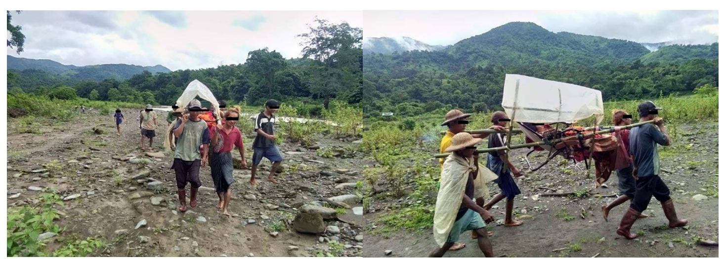
Figure 2. Common transportation method in rural area of Myanmar (photo taken near Matupi Hospital).

We identified the following urgent issues in need of remediation: 1) improvement of trauma-related signal functions in basic-level facilities; 2) improvement of traumaand critical care-related signal functions in intermediate level facilities; and 3) implementation of a comprehensive nationwide survey to uncover emergency care deficiencies in rural areas, with emphasis on the time required for referral to higher-level facilities. Our suggestions to address the issues identified in our study can be summarized as relating to the reinforcement of infrastructure and human resources within each level of facility. In addition, prehospital care and