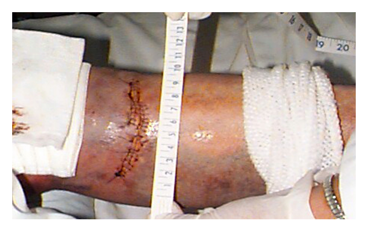
Figure 3. Left lower extremity laceration due to contact with car alarm LED