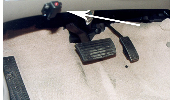
Figure 4. Car alarm LED

into three sections: crash variables, VAS and AIS injury assessments, and disability outcome predictions. Paramedic-reported crash variables were compared with the corresponding variables from the formal crash investigation report, which was considered the gold standard.