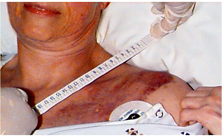
Figure 2. Seatbelt-related contusion and abrasion