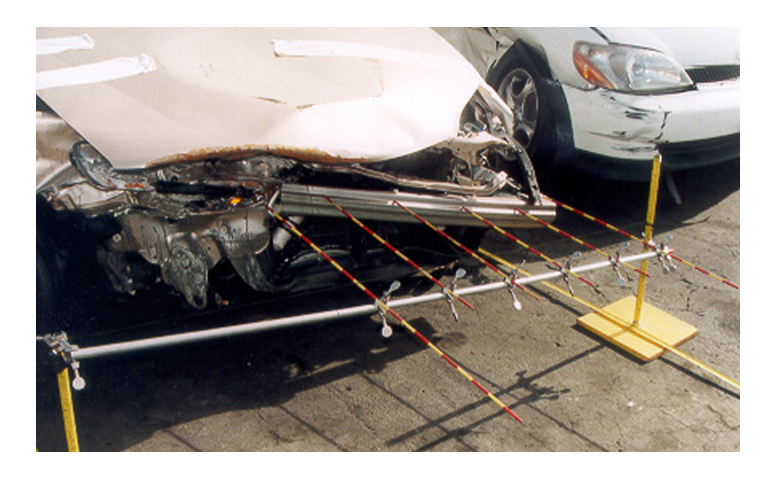
Figure 1. Frontal damage with measurement of vehicle deformation