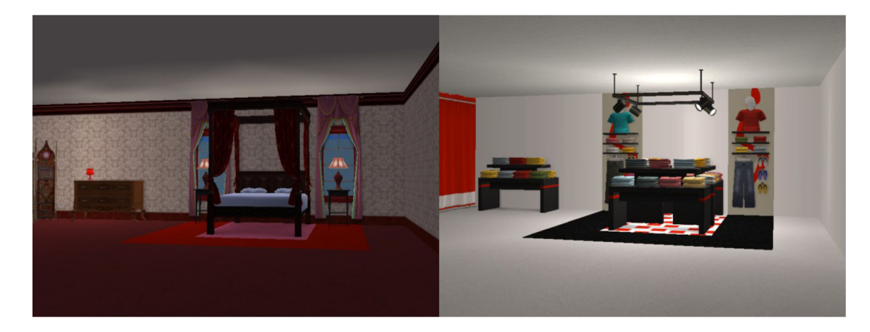
Figure 1. Images of spatially mapped virtual stimuli used in the virtual tour paradigm.

On the left is a bedroom scene, one of many possibly toured in the encoding phase. The right panel shows a clothing store, toured in the test phase, that has the same spatial configuration but is otherwise novel within the context of the experiment.