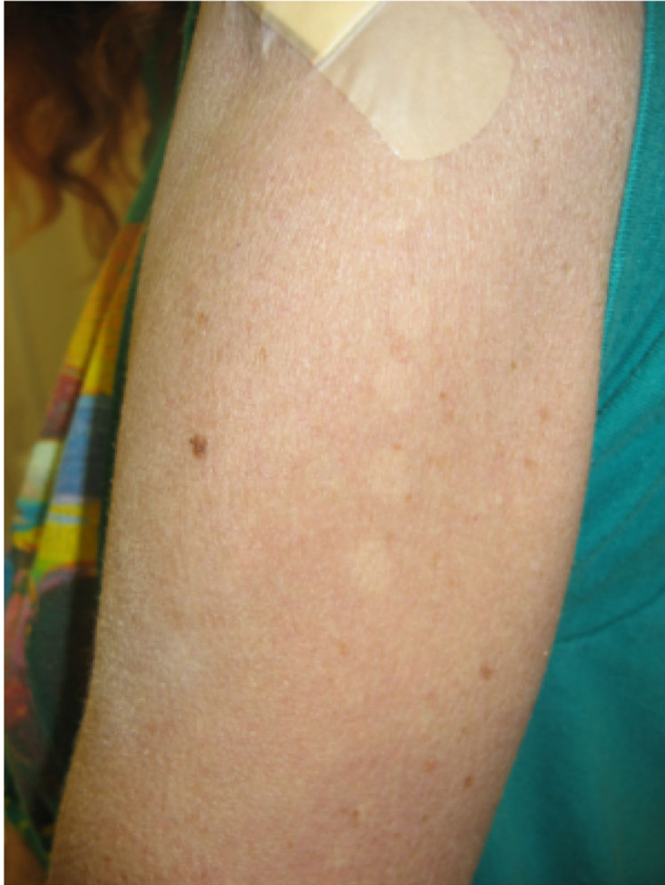
Figure 3. Lightening of left shoulder test spots noted 16 months after treatment with 755-nm laser.