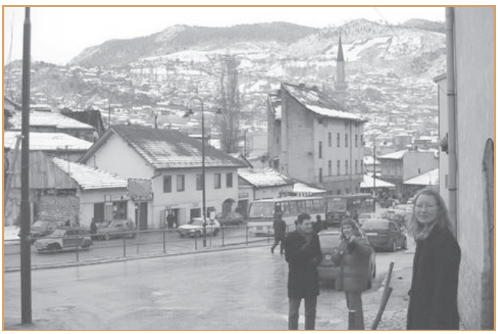
Nyla Rodgers in Sarajevo

Due to ethnic cleansing during the Bosnian war, towns are still very segregated. EFP's structure seeks to break through these barriers. After a class has completed the EFP program they work in tandem with another class of a different ethnicity, who has also completed EFP program, to put together a performance dedicated to teaching the lessons that they have learned about peace. They