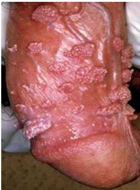
Fig. 3. Penile warts.

A variety of therapies exist for treatment of anogenital warts (Table 2). The goal of therapy is to eliminate as many of the visible lesions as possible until the patient's immune system can control viral replication. Because of the phenomenon of spontaneous regression, the need to treat subclinical or mild disease continues to be debated. Unfortunately, HIV-positive or immunosuppressed patients will often require more than one treatment modality to manage refractory condyloma. Before any ablative therapy is performed, a biopsy is considered