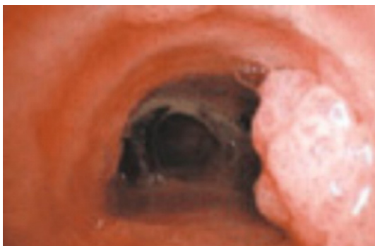
Fig. 4. Juvenile-onset recurrent respiratory papillomatosis.

The mean age at presentation for anogenital warts in children ranges from 2.8 to 5.6 years [15]. Most children present because of a small flesh-colored papulae are noted by their caretaker. The lesions can develop rapidly into clusters of flat, papillomatous or pedunculated lesions, and occasionally larger cauliflower- or strawberry-type masses may develop. In girls and boys, the perianal site is the most common occurring in 37% and 57%, respectively. The labial site accounts for 23% in girls. Girls may also have warts on the hymen or in the vestibular fossa. In boys the penis and scrotum sites account for 17%. HPV types 6 and 11 account for 39–90% of anogenital warts in children. Most children are asymptomatic, although some warts can be a source of itching, burning and bleeding. Some children may complain of pain and/or bleeding with bowel movements, and girls with periurethral warts may experience dysuria.