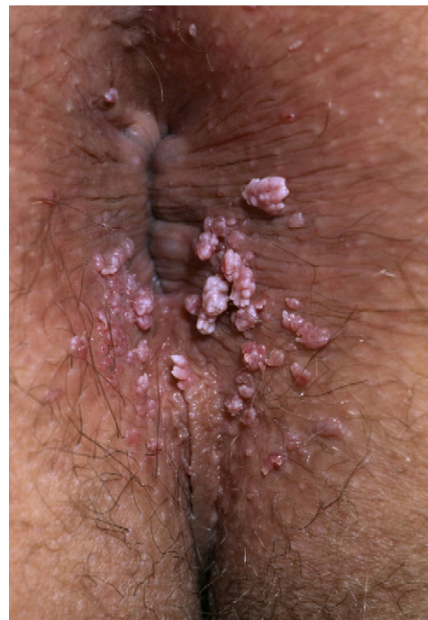
Fig. 2. Perianal warts.

Condyloma acuminata in men may also develop on the penis, and when they do, most commonly involve the glans penis, penile shaft and prepuce (Fig. 3) [9]. Involvement of the meatus and urethra occurs only rarely and constitutes a greater therapeutic