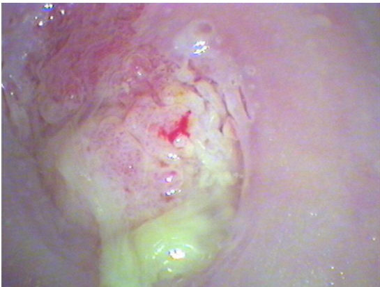
Fig. 5. Cervical cancer.

Vulvar cancer accounts for about 4% of all gynecological cancers and typically affects women during the 7th and 8th decades of life. Younger women with risk factors (e.g., HPV infection, immunosuppression) are also at risk. During 2007, it is estimated that 3490 new cases of vulvar cancer will be diagnosed in the United States and 880 deaths from this disease will occur [18]. Just as squamous cell carcinoma of the cervix is preceded by an intraepithelial neoplastic process that lends itself to study and treatment, the vast majority of cases of squamous cell carcinoma of the vulva also follow an intraepithelial precursor lesion called vulvar intraepithelial neoplasia (VIN, Fig. 6).