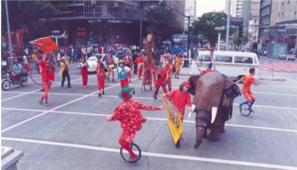
Photo 1. Waste Picker Theater Group in Downtown Belo Horizonte

Notably, the Brazilian waste picker movement has placed relatively more emphasis on art and culture than has the Colombian movement. This discrepancy, in part, reflects a difference in national social movement cultures, as Brazilian social movements have an exceptionally strong tradition of collaborating with musical, theatrical, and visual artists. It also reflects the fact that the Brazilian movement has received a higher degree of financial support, particularly from the state, generating more resources to dedicate to artistic endeavors. Yet the Brazilian movement's deep embrace of cultural repertoires is not merely a circumstantial happenstance or extemporization. Rather, it is a cultivated and calculated tactic of the political participation strategy, which hinges on winning the support of thousands of elected officials and, in turn, their voter base and influential political actors. 66