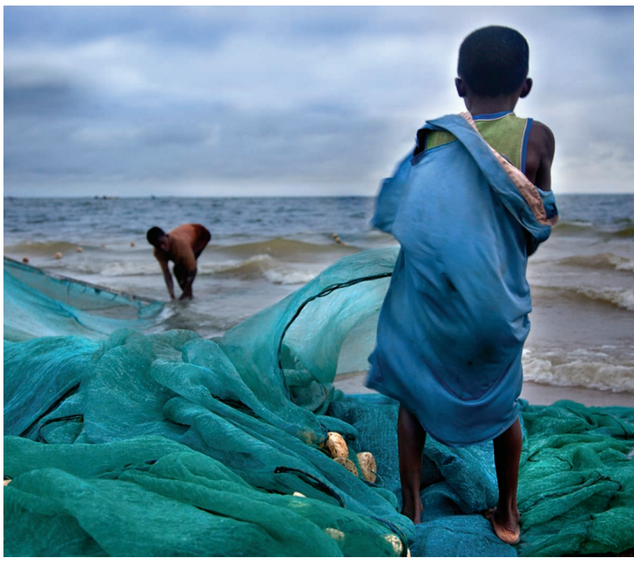
Children enslaved for fishing labor in the Brong Ahafo region of Ghana, 2010.

The harvest of wild animals from land and sea provides more than $400 billion annually, supports the livelihoods of 15% of the global population, and is the main source of animal protein for more than a billion of Earth's poorest inhabitants (2, 3). Humans have always depended on wildlife, but the contemporary depletion of wildlife, combined with unprecedented market globalization, has heightened the economic stakes and desperation of consumers. The