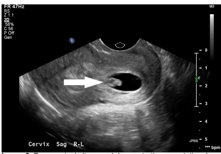
Image 2. Transvaginal ultrasound demonstrating a gestational sac (arrow) in the left endocervical canal.