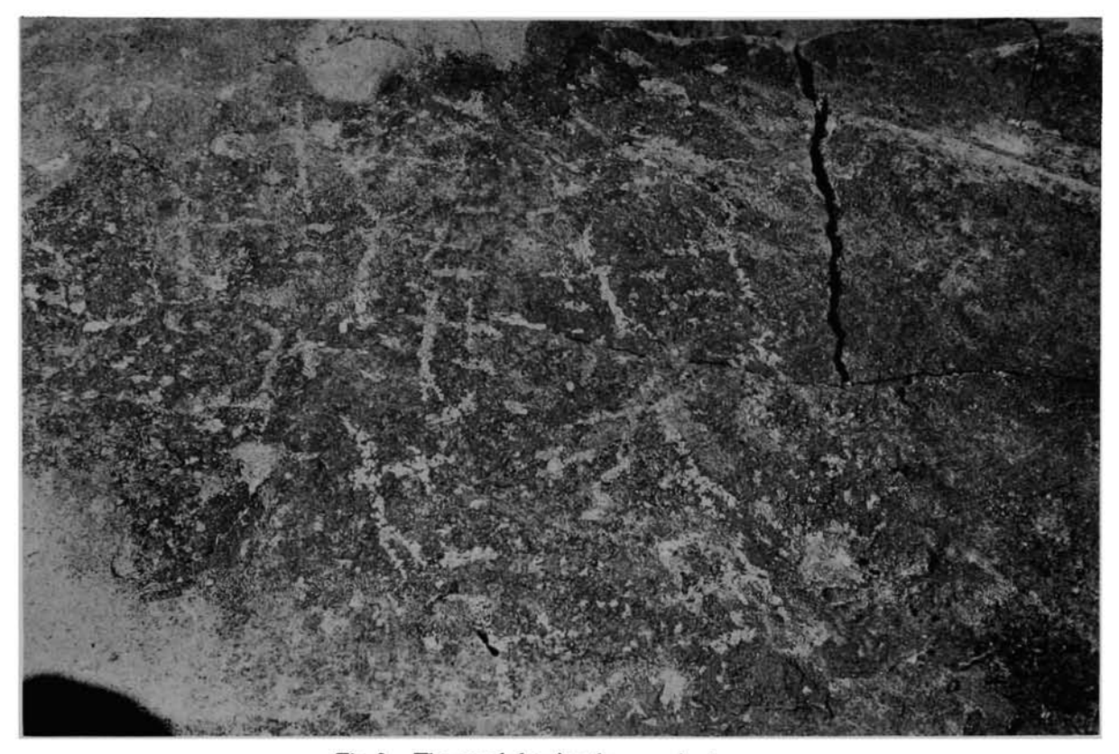
Fig. 2. The panel showing the opposing bowmen.

two individuals armed with bows face each other but no arrows are depicted in flight. The style of the figures is quite different from those at CA-INY-1375, with much greater detail (feet, toes, arms, etc.) being shown (although there is reason to suspect that these figures might be modern). One other example of opposing bowmen in the Cosos was reported at Panamint City (Ritter et al. 1982:12, Fig. II-3f). The Panamint City example depicts two anthropomorphs in close association, but their being opposing bowmen is questionable.