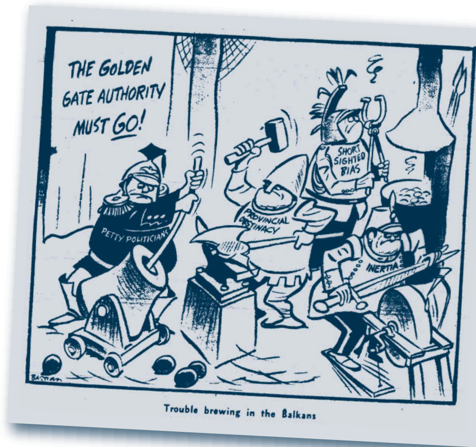
FIGURE 2 San Francisco Chronicle February 11, 1959

By the time Governor Pat Brown went on record in favor of creating the Authority, it was already too late. San Francisco Chronicle editors commented that “the demise of the Authority proposal—as amended and reamended by the Legislature—may prove a mercy killing.... [It] was so thoroughly emasculated in terms of representation, of power, function and duty, that enactment might have created more problems than it solved.”