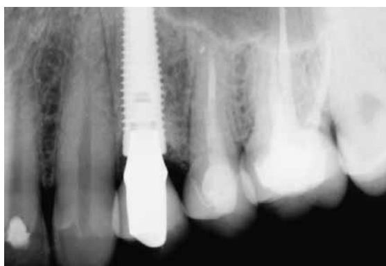
Fig 8 Periapical radiograph 3 years after implant placement.

mouth with 0.2% chlorhexidine mouthwash thrice a day without brushing the implant area until suture removal (10 to 14 days after).