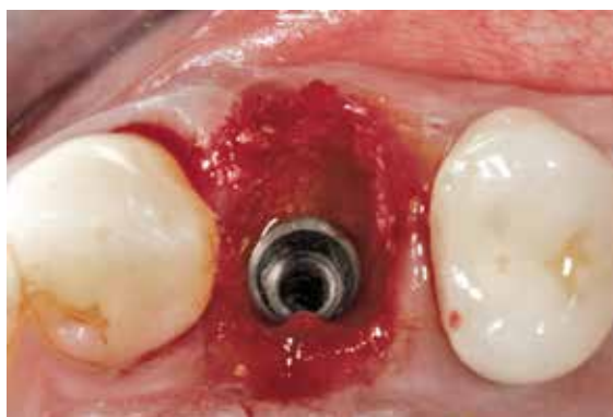
Fig 4 The gap between implants and the surrounding bone was filled with 0.25 to 1 mm granules of anorganic bovine bone hydrated using the patient's blood mixed with antibiotic solution.

the implant platform was positioned 1.5 mm below the buccal wall margin (Fig 3). The insertion torque values of the implants were measured and recorded during surgery using a surgical unit (OsseoCare Pro