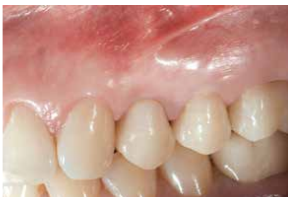
Fig 7 Clinical view of the final CAD/CAM zirconia-ceramic restoration 3 years after implant placement.