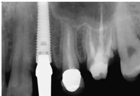
Fig 6 Periapical radiograph immediately after implant placement.