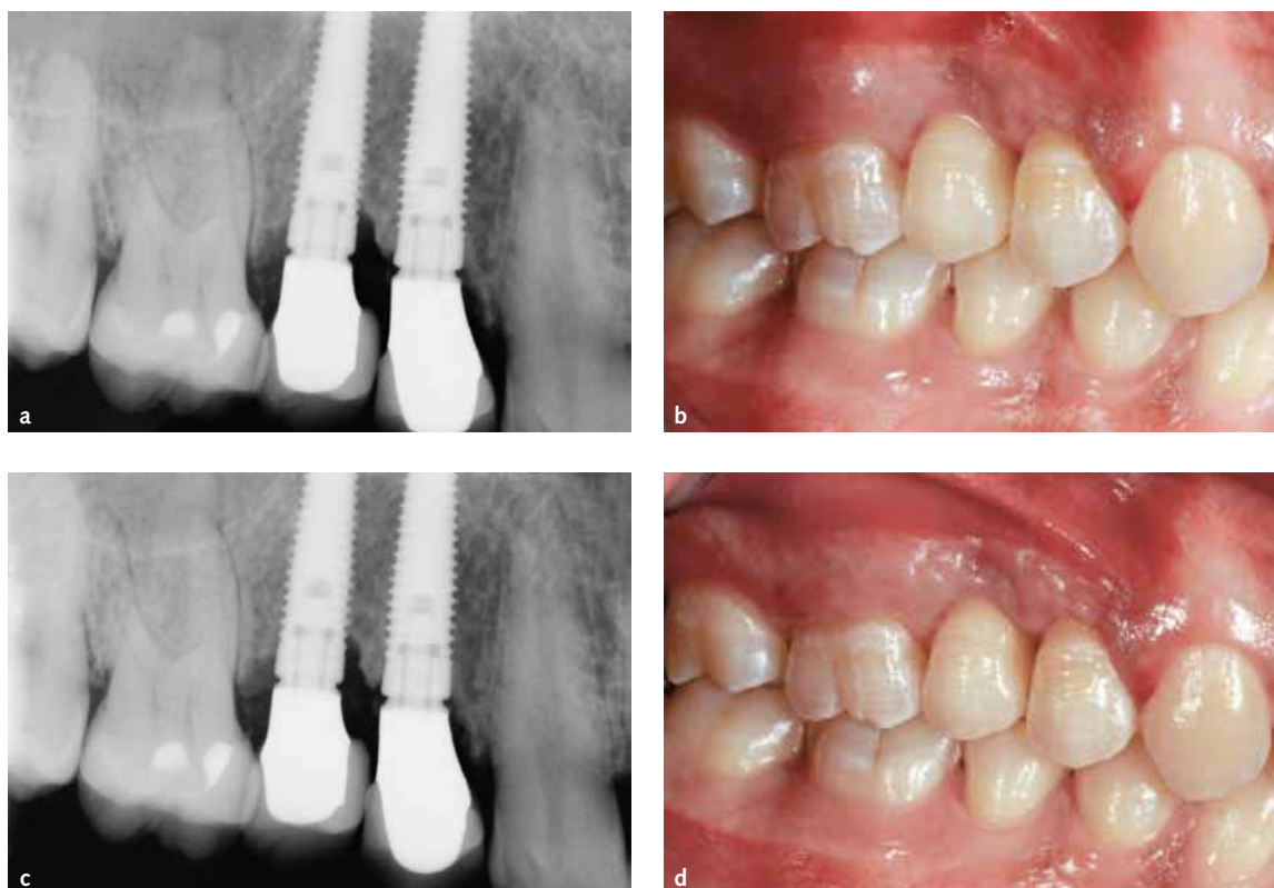
Fig 9 Sequence of treatment of the only complication (peri-implantitis): a) periapical radiograph 2 years after implant placement showing a bone loss up to the third thread; b) clinical situation 2 years after implant placement showing bluish discoloration of the soft tissue related to the inflammation; c) periapical radiograph at the 3-year follow-up, showing stable peri-implant bone; d) clinical situation 3 years after implant placement, showing a healthy peri-implant tissues with no sign of inflammation.