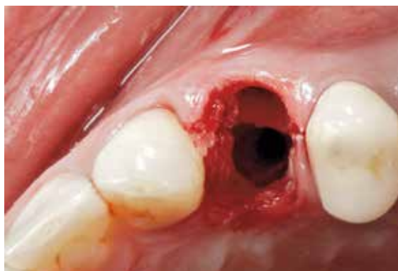
Fig 2 The premolar was atraumatically extracted sectioning the tooth into two separate roots, fully preserving the interdental septum.