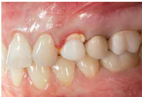
Fig 5 A pre-fabricated zirconia abutment was tightened to the implant and an acrylic temporary restoration was relined in situ. A collagen sponge was applied to fill the void between the gingival tissue and the abutment surface.