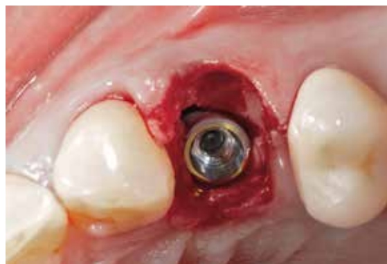
Fig 3 The implant was immediately placed in the palatal socket and 1.5 mm apical to the intact buccal bone level.