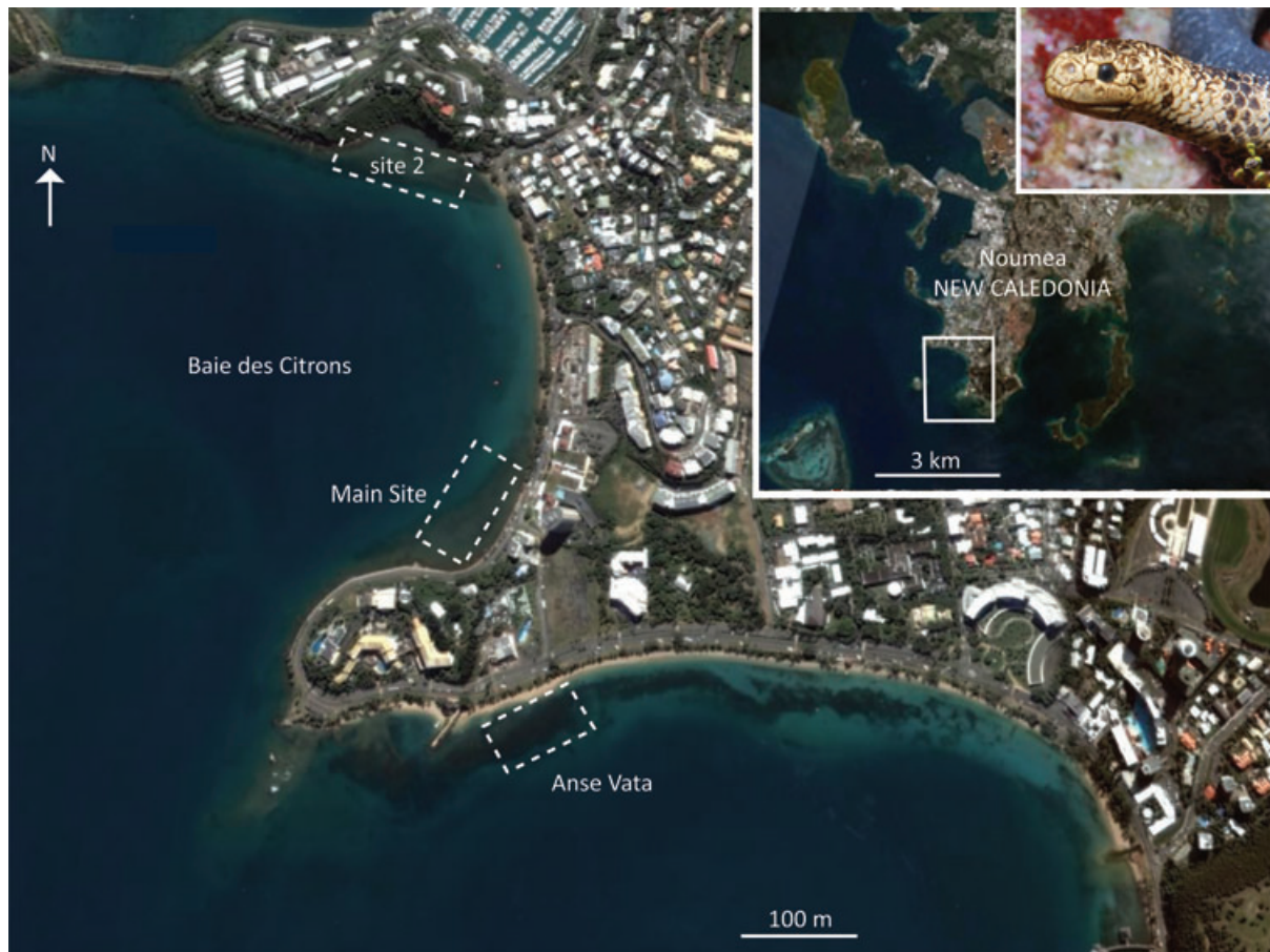
Figure 1. Map of study area showing the two main study sites in Anse Vata and Baie des Citrons and the second Baie des Citrons study site to the north (note small scale of map). Insert shows where bays are located in Noumea, New Caledonia. Photo of Emydocephalus annulatus , courtesy Nigel Marsh.

Significance levels were calculated using Markov chains run for 1,000,000 steps and were adjusted for multiple comparisons using sequential Bonferroni corrections (Rice 1989).