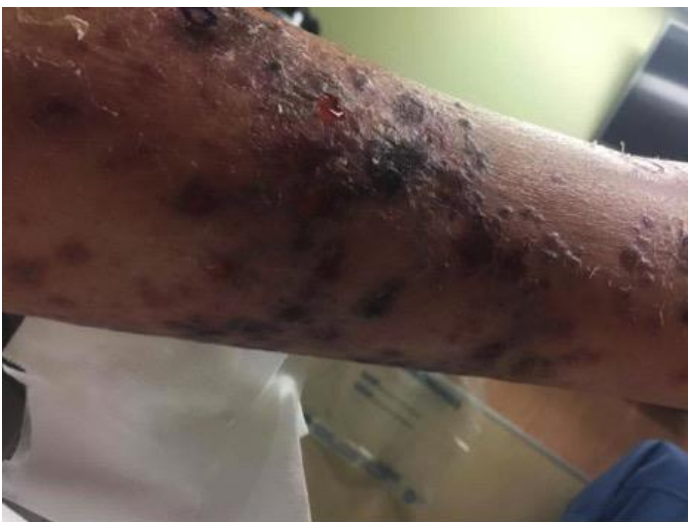
Figure 2: Palpable purpura. On the left leg, multiple violaceous papules coalescing into plaques.

combination with no improvement in his symptoms. He had also been doing bleach washes and gentamicin ointment as wound care. Given his worsening skin symptoms as well as worsening pain, he presented to the ED on the recommendation of his dermatologist. He described the leg pain as dull, constant and aching, isolated to the area of ulceration and non-radiating. The pain worsened with palpation. He denied any significant drainage from wounds, fevers, leg swelling, or shortness of breath. On examination, the left lower leg had multiple well-demarcated 1-3cm ulcers with sharp borders and shallow fibrinous bases ( Figure 1 ).