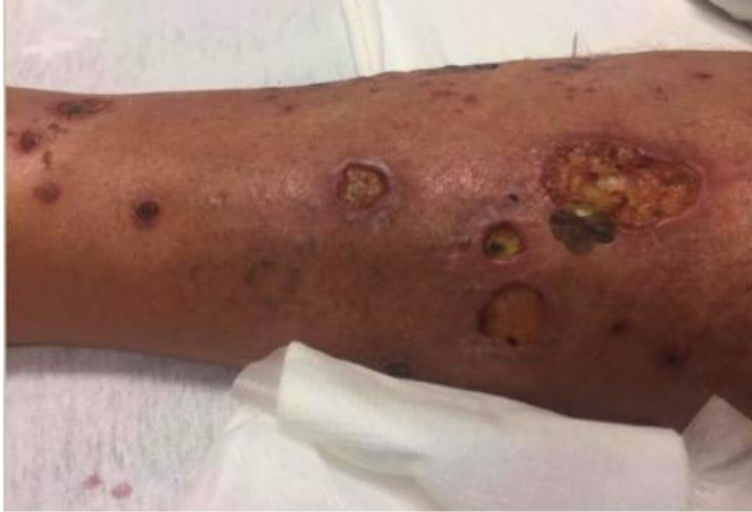
Figure 1. Leg ulcer. The left lower leg had multiple well-demarcated 1-3cm ulcers with sharp borders and shallow fibrinous base. Additionally, there were multiple scattered violaceous papules covering the left calf.

combination with no improvement in his symptoms. He had also been doing bleach washes and gentamicin ointment as wound care. Given his worsening skin symptoms as well as worsening pain, he presented to the ED on the recommendation of his dermatologist. He described the leg pain as dull, constant and aching, isolated to the area of ulceration and non-radiating. The pain worsened with palpation. He denied any significant drainage from wounds, fevers, leg swelling, or shortness of breath. On examination, the left lower leg had multiple well-demarcated 1-3cm ulcers with sharp borders and shallow fibrinous bases ( Figure 1 ).