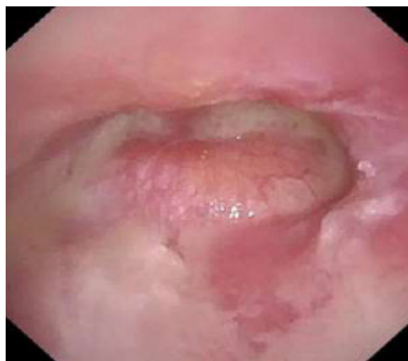
Image 1. Otoscopic view of the middle ear demonstrating an erythematous, bulging tympanic membrane with purulent effusion.

The patient underwent mastoidectomy and was treated with antimicrobial and antithrombotic therapies. During surgery, it was found that the right middle ear was filled with eosinophilic granulation tissue, with the formation of a path between the mastoid part of the temporal bone and the posterior neck (Image 3). Intraoperative intratympanic steroid administration eliminated the granulation tissue a few days after the surgery. The patient was treated with antimicrobial therapy for six weeks. He was discharged with higher functional impairment and gait disturbance. However, he