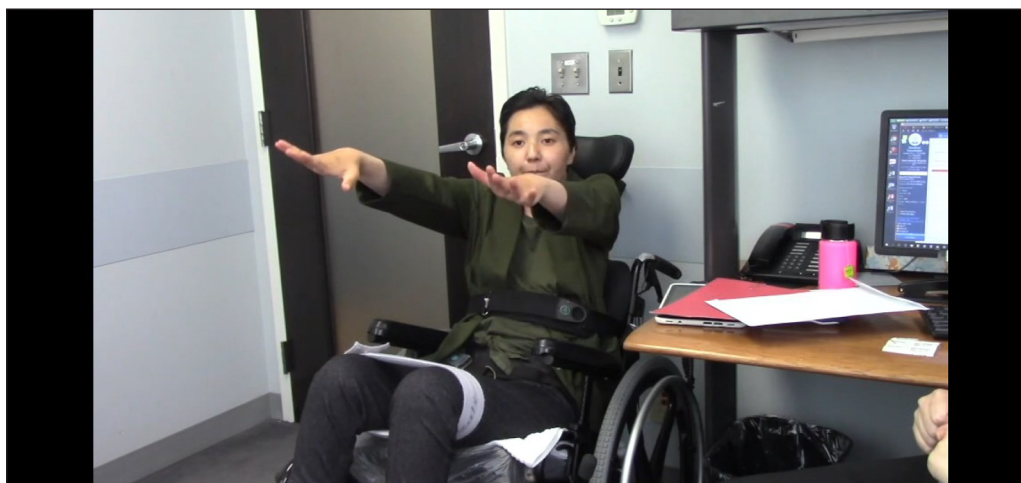
Video 2: 12 Months Post-DBS. The patient’s myoclonic movements are reduced, and ability to perform functional tasks are improved.

Previously published case reports of DBS for PHM used the awake stereotactic technique involving microelectrode recording and intraoperative testing for placement [7–10]. Here, we report the first use of asleep iMR-guided method for lead placement in PHM. This technique offers several advantages compared to awake surgery. First, patients with PHM may have