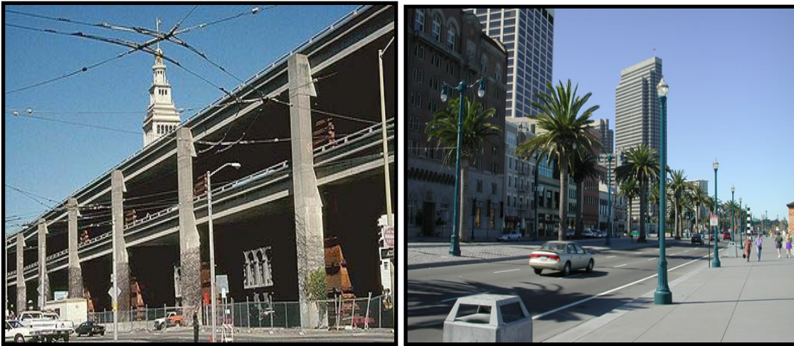
Photo 1. Replacement of San Francisco's Waterfront Embarcadero Freeway with an At-Surface Artery