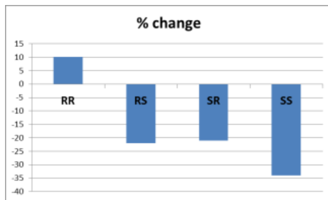
Figure 3: Mean percentage change in route perspective on the last participant block in the four priming conditions.

We then ran a one-way ANOVA with condition (consistent route, inconsistent route-then-survey, inconsistent survey-then-route, and consistent survey priming by confederate) as an independent variable and mean % use of route perspective on the last block as the dependent variable, again subtracting the baseline (see Figure 3). There was again an effect of condition on the average % change in route perspective use, F(3, 63) = 3.70, p<.05 . LSD tests revealed reliable differences between the consistent route and the consistent survey conditions ( p<.05 ). None of the other differences were reliable. In the consistent route priming condition, participants used the route perspective on average 10% more on the last block than on the initial baseline block, and in the consistent survey condition, they used the route perspective on average 34.38% less on the last than on the initial block.